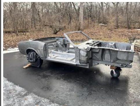
Back from Redi Strip