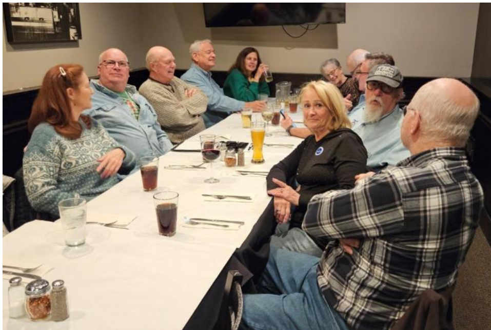
Photo of the Month Our Group at the Annual Pizza Meeting