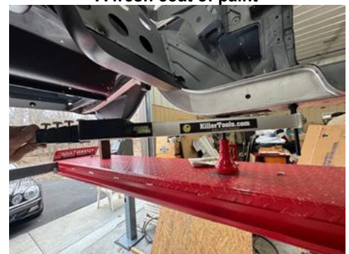
Frame rail, trunk floor problems solved