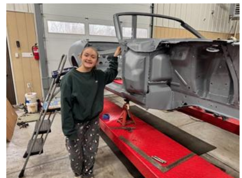
A fresh coat of paint