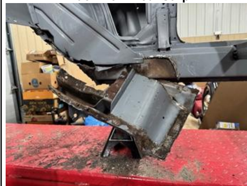
Some rear frame rail issues