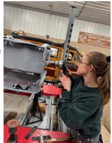
Removing some spotwelds