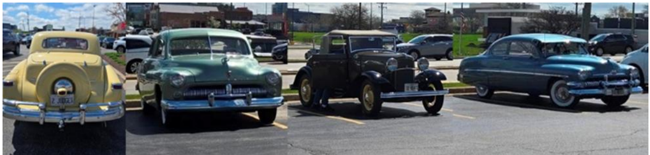
Photo of the Month Early V-8s at the Eggs & Eights Breakfast