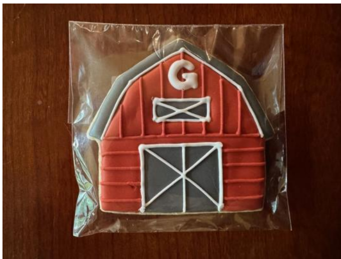
No party would be complete without dessert – Carolyn Bounds' Gilday Barn Cookies