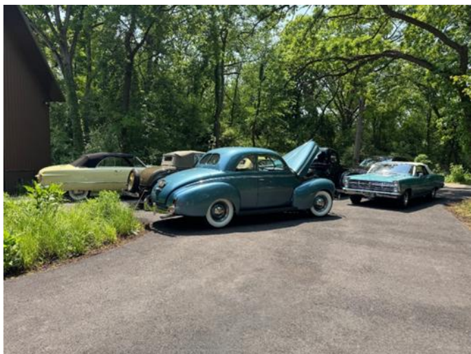
Tom O'Donnell's Mercury is ready for inspection