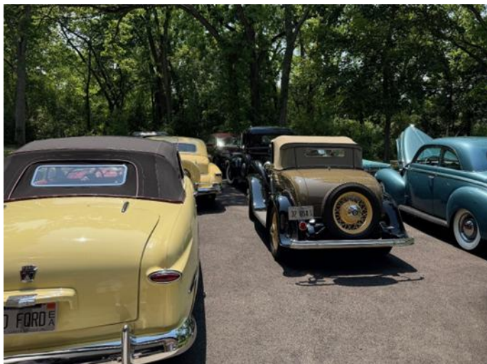
The V-8s are lined up