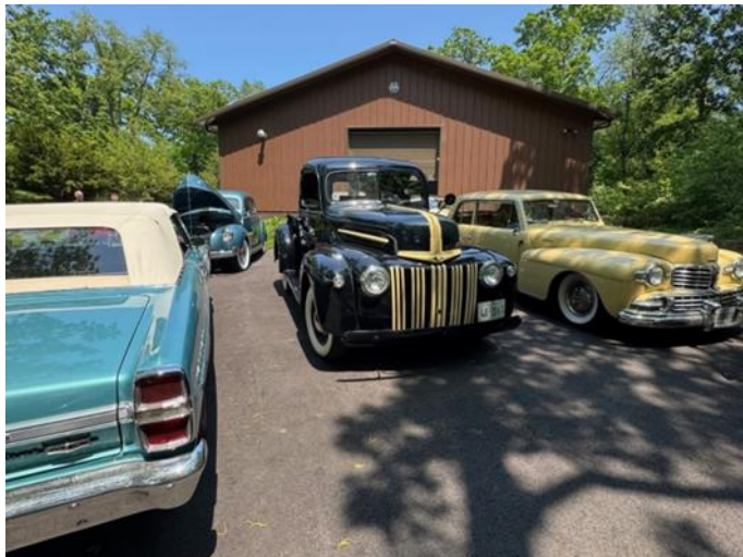
Some nice rides