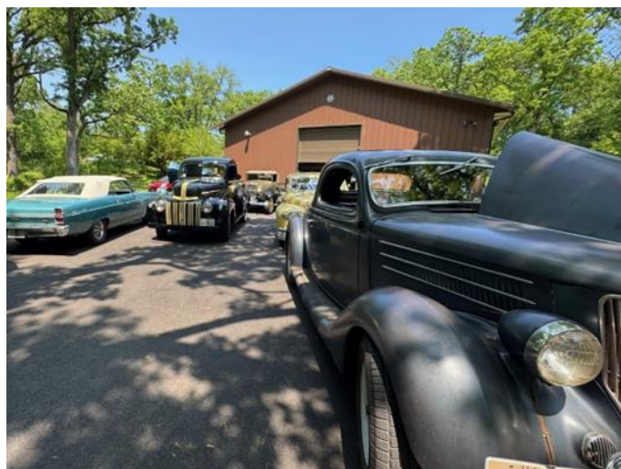
Andy's 36 makes a good showing