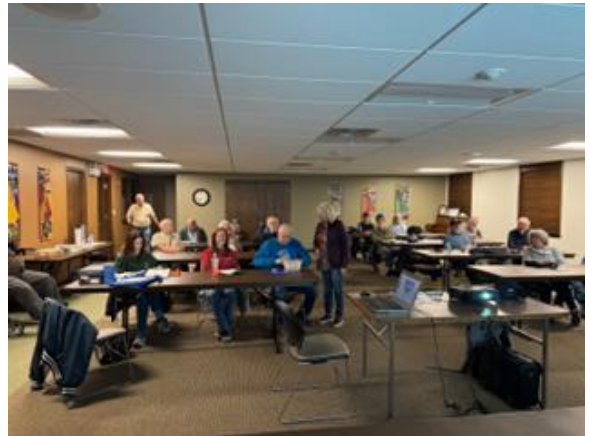
Above and below - great meeting turnout

First, I would like to thank every one who came to our barn warming tour on May 31st. We had great weather, a great turnout, and a great time. Please see Page 4 for more details.