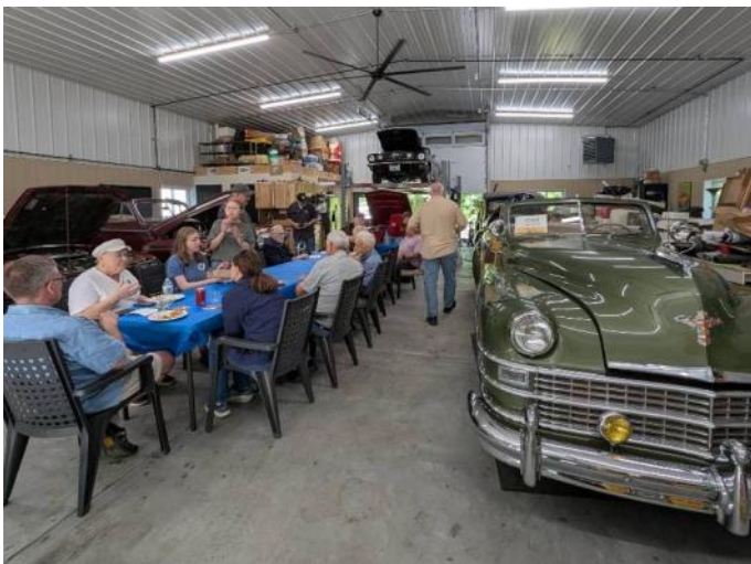
The group enjoys lunch