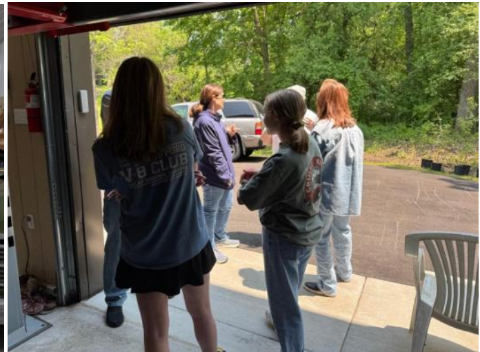
important discussions being held