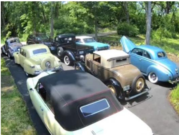
Quite a show!