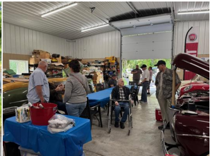
We spent some time kickin' the tires