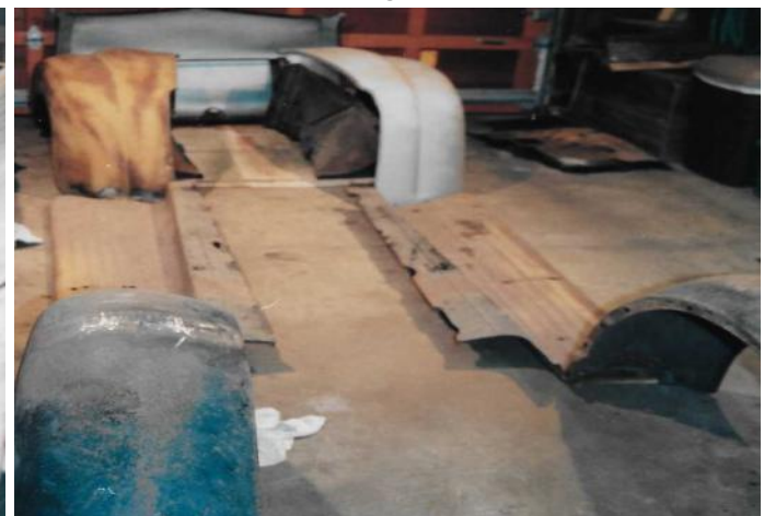
Fenders and Running Board