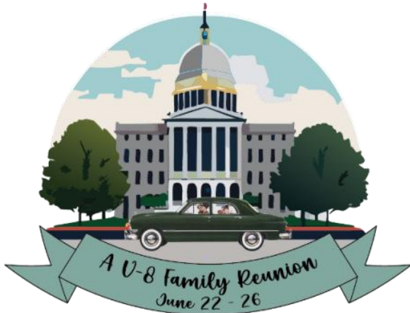
2025 Central National Meet Springfield, Illinois