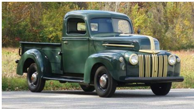
1945 Model 59C restored to its original glory

The U.S. War Production Board authorized a resumption of civilian pickup truck production in February of 1945 when it perceived a need for trucks for business and agricultural use. Initially a clone of the 1942 Model 29C pick up was produced. By May the trucks had been designated as Series 59C incorporating the modifications prepared for the 1946 models. These early pickups were designated 1945 models and the 59C series was continued throughout 1946. The pickups were the only civilian trucks built by Ford in 1945 and came only in "Village Green" with cream colored grills. Just 564 of these trucks were built in 1945 and they were not equipped with a spare tire due to war time shortages. These early post war trucks were eagerly purchased by businessmen and farmers weary of repairing and maintaining their tired older model pickups.