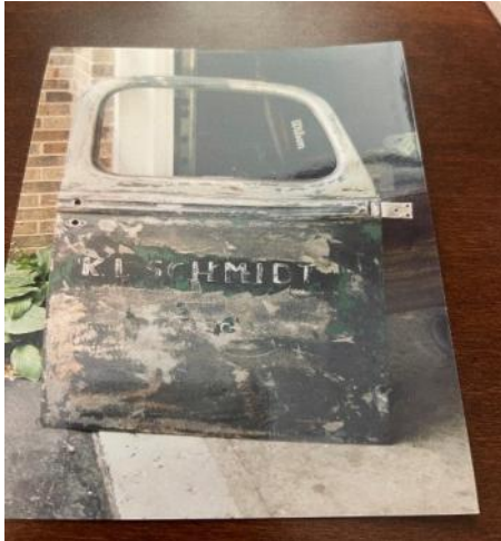
K L SCHMIDT