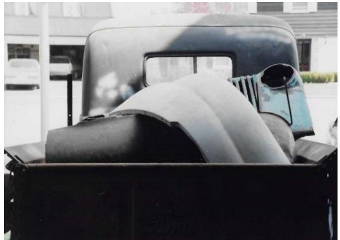
My new project arrives at home with a "truckload" of parts

gine in our driveway. While he was annoyed with me hanging around and asking lots of questions, he appreciated my fetching the different tools he needed to get the job done. In high school, I tinkered with my 1936 Plymouth but didn't have the interest to rebuild its oil burning engine. When I was in the Navy, I had a 1958 Chevy that squealed when I raced the engine. A friend convinced me that the lifters were "floating," so I packed the hydraulic lifters with washers. I discovered the real problem was a bad timing gear. Then came an engine overhaul of my 1965 VW Bug in the same driveway my brother used. Over the years I did most car maintenance and repair jobs by rolling up my sleeves and diving into repairs. I read the Motors Repair Manual and any other book I got my hands on, because back then, YouTube or AI wasn't created yet. I convinced myself and my wife that I could handle a restoration project of the 1945 Ford pickup truck.