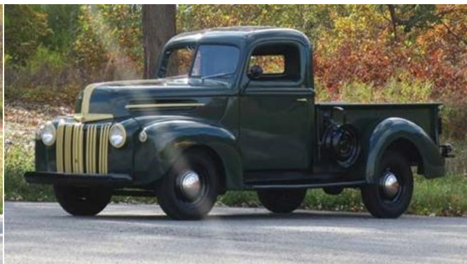
True to form this example also lacks a spare