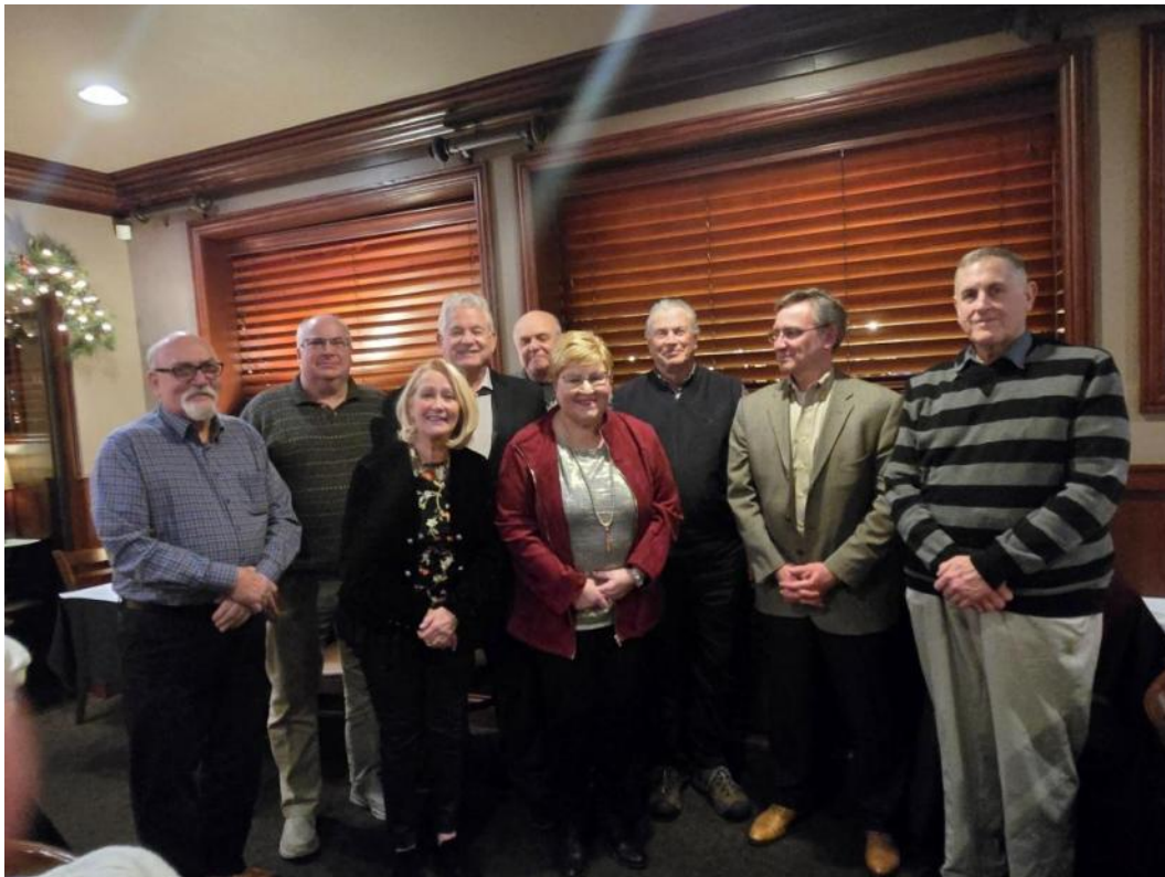
Photo of the Month NIRG Officers for 2025