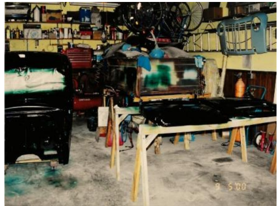
Garage Paint Shop