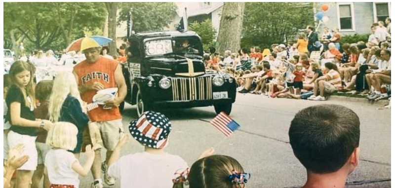
The truck finally makes it to the 4th of July parade!