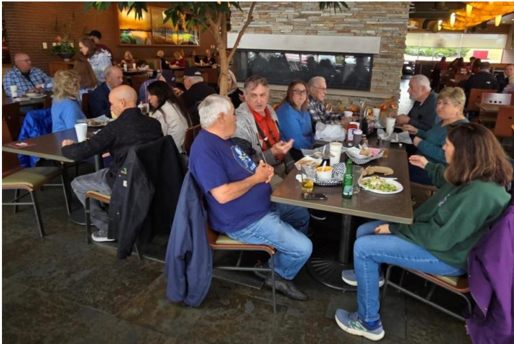
Photo of the Month Our Group Enjoying the Annual Veteran's Luncheon