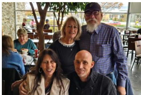
The Zulas Family