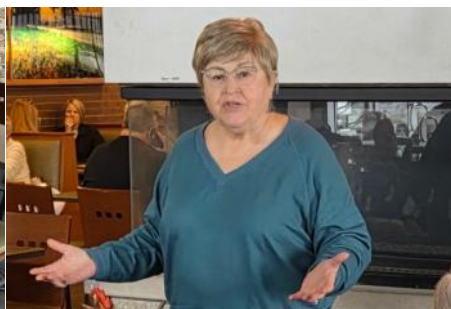
Este thanks the Veterans