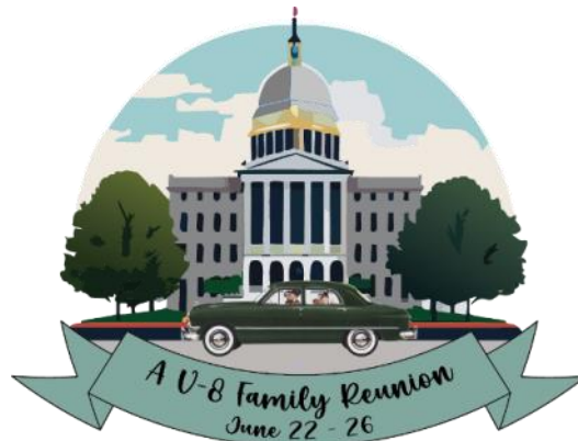
2025 Central National Meet Springfield, Illinois