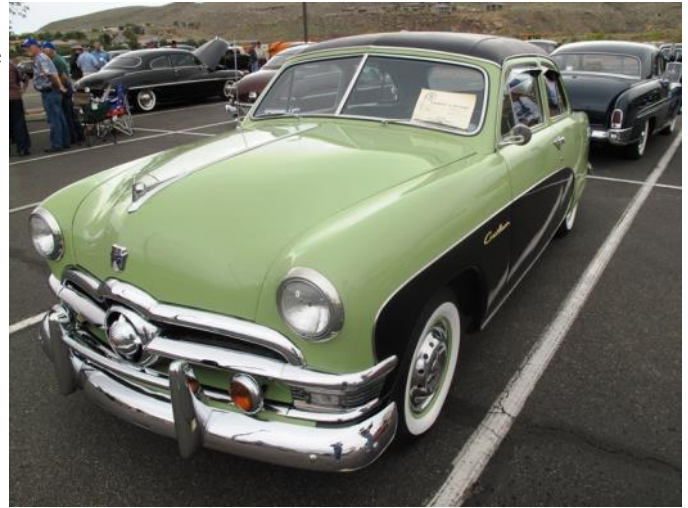
1950 Ford Crestliner - Ken Ballew, Texas