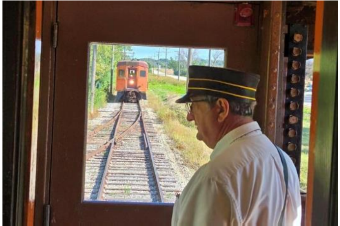
That light is an oncoming train!