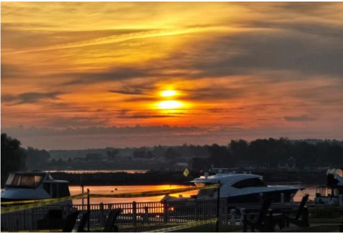
Sunrise from our balcony