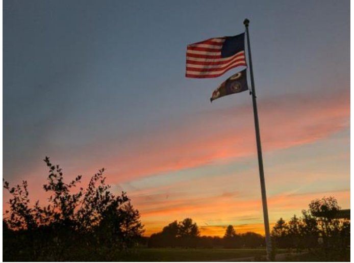
Dawn's beautiful photo needs no caption

Suddenly it was over. A big "thank you" to everyone who helped clean up the meeting room and took care of the leftovers. Most of us went to the lobby to chat and to reflect on a fun weekend of V-8 camaraderie. In the morning, several of us had breakfast, then we all went our separate ways. It was a really fun weekend; the weather was outstanding and the three early V-8s ran flawlessly. We thank everyone for their contributions to a great time and for contributing many photos; we already have our reservations for next year. See you September 26th!