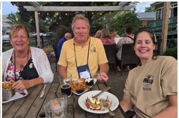
A few NIRG members enjoying dinner at the Wood Boat Brewery