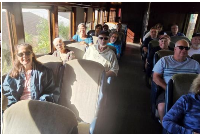
Our group on the train