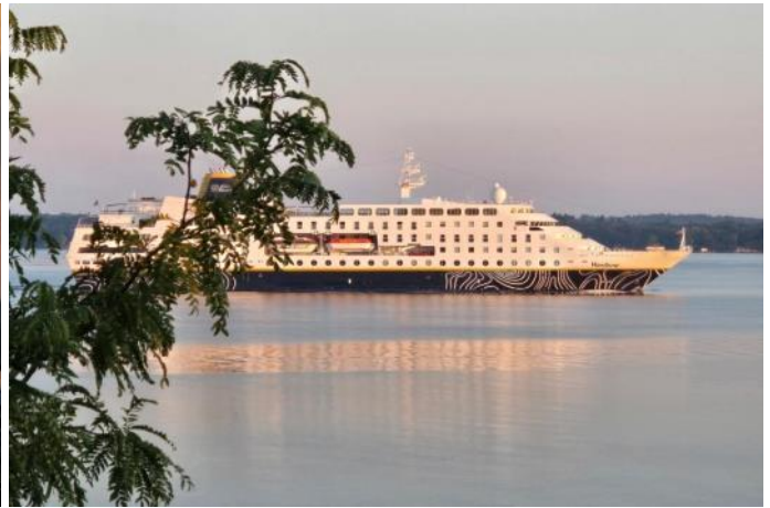
The cruise ship Hamburg passes by