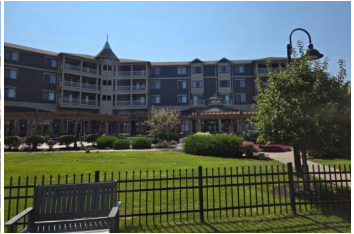
The Meet Hotel, 1000 Islands Harbor Hotel - from the front, left and from the St. Lawrence river