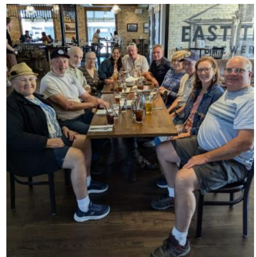
Leisurely lunch at East Troy Brewery