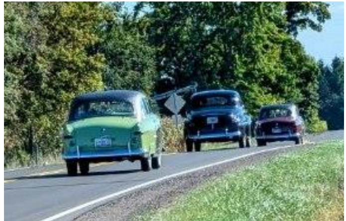
Our Early V-8s on the road