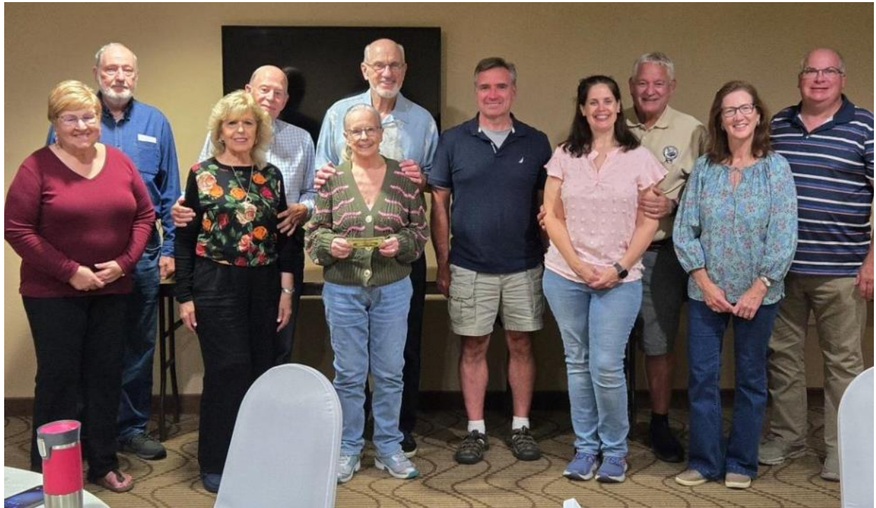
Photo of the Month Our Group at the 16th Annual Poker Rally