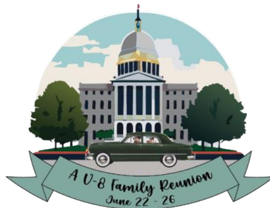
2025 Central National Meet Springfield, Illinois