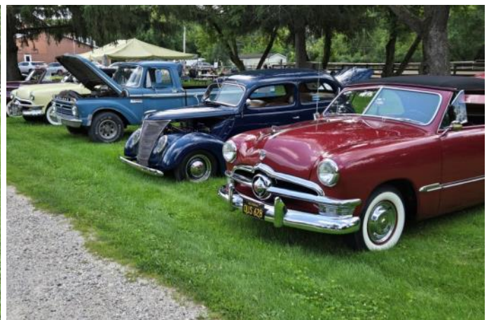
Some of the Early V-8's Present