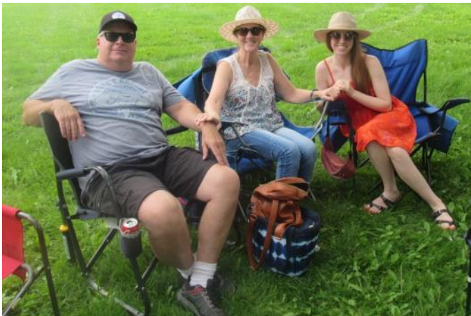
The Osborne family