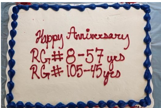
Anniversary cake for two RG's