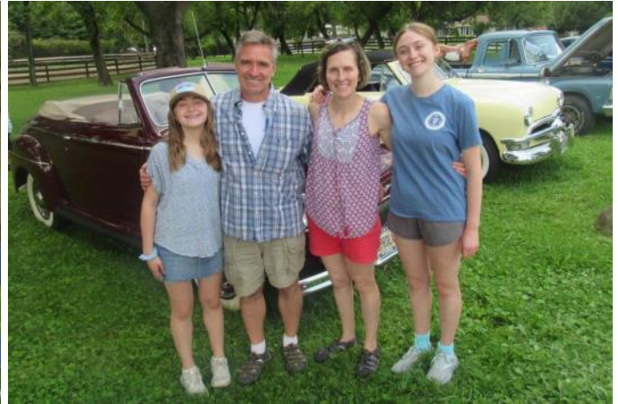
The Gilday family