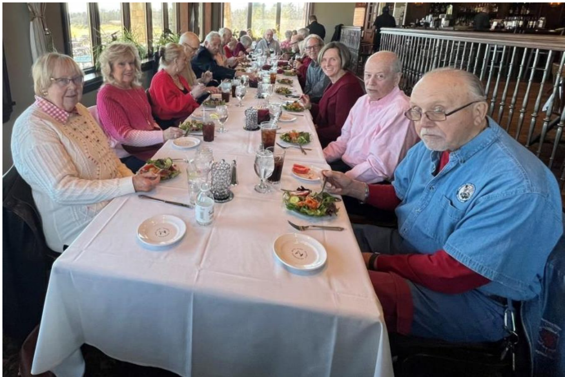
Photo of the Month Our Group at the Valentine's Luncheon