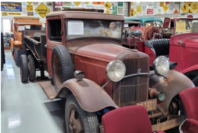
1932 Model BB Dump Truck - one of several