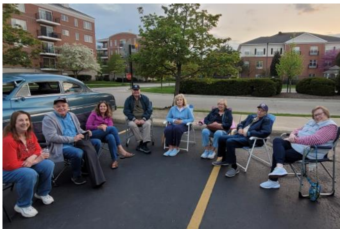
Enjoying the beautiful evening with friends