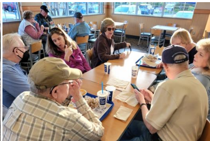
Dinner at Culver's