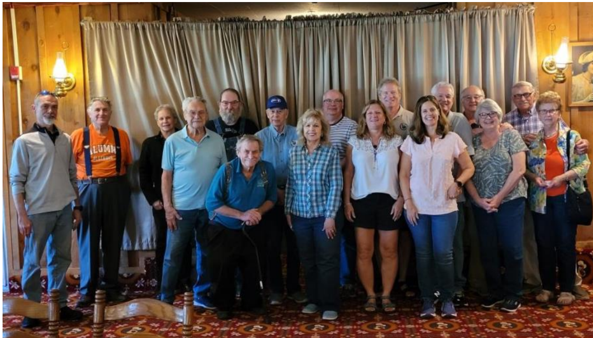
Photo of the Month Our Members at White Fence Farm After Beller Museum Tour