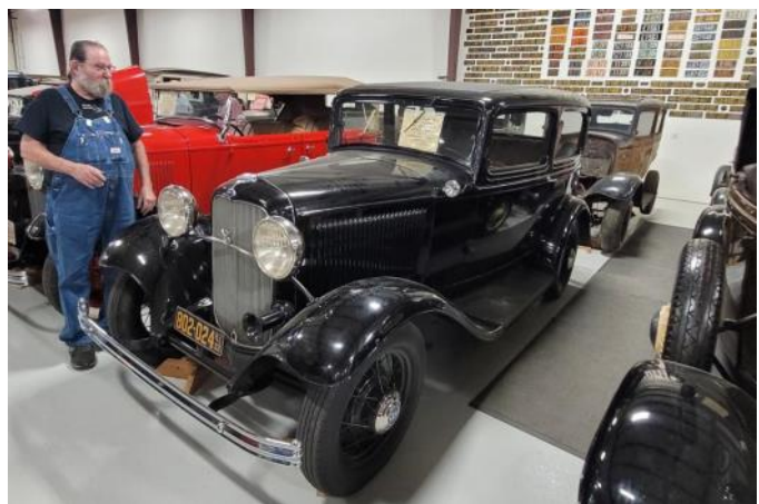
Jordon stands beside an unrestored 1932 Ford V-8 Standard Tudor Sedan with 29,220 original miles!