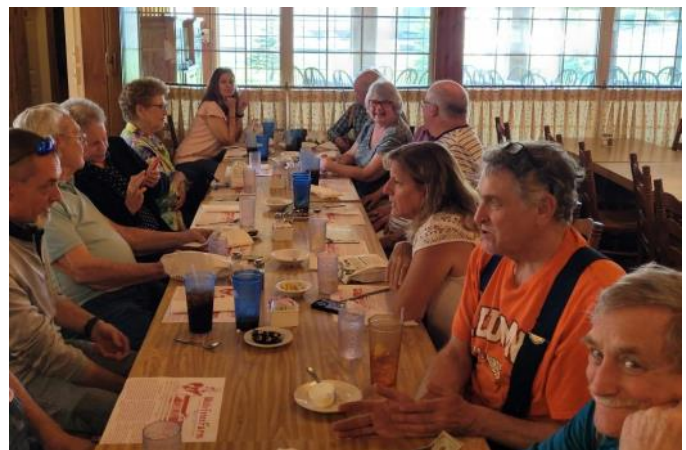
Lively conversation at the White Fence Farm Lunch