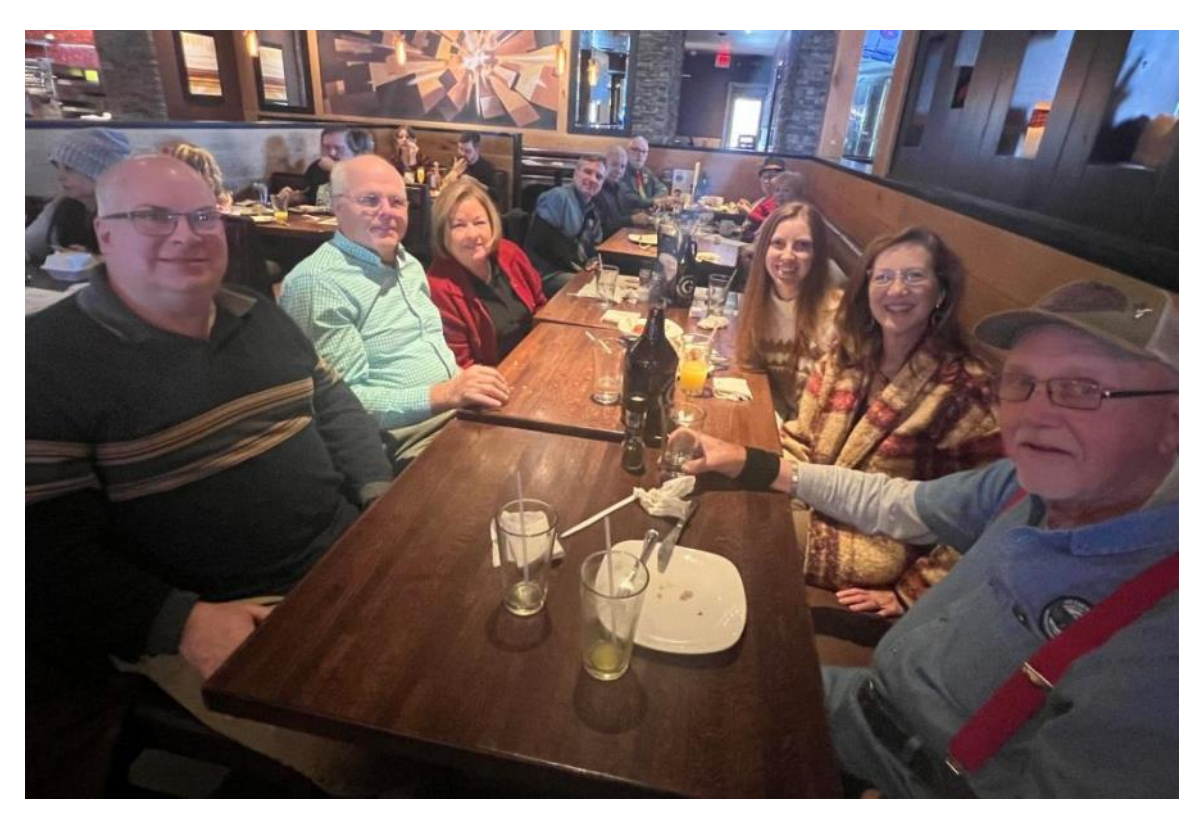
Photo of the Month Part of our Group at the Annual Christmas Brunch