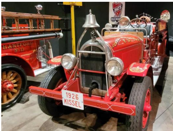
Kissel built many vehicles from cars to firetrucks