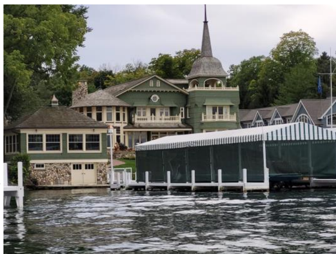
The Mecum home - it is bigger than the picture appears