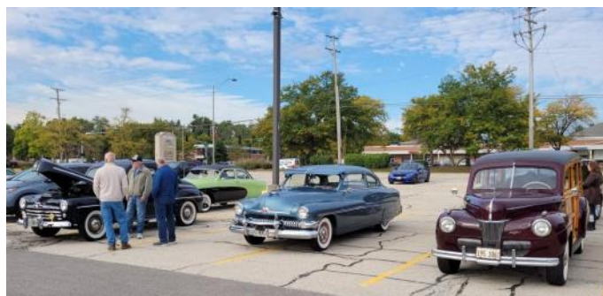
Ready to go in Arlington Heights