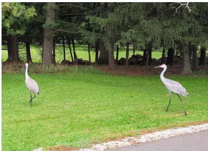
We had to dodge a lot of these Sandhill Cranes