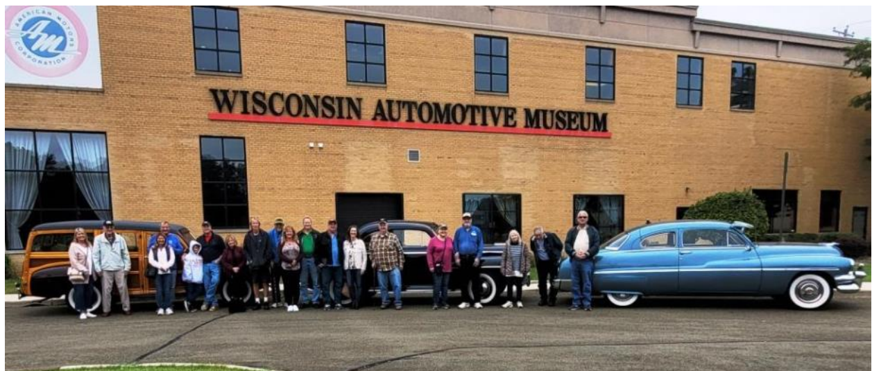
Photo of the Month Our Poker Rally Group at the Wisconsin Automotive Museum