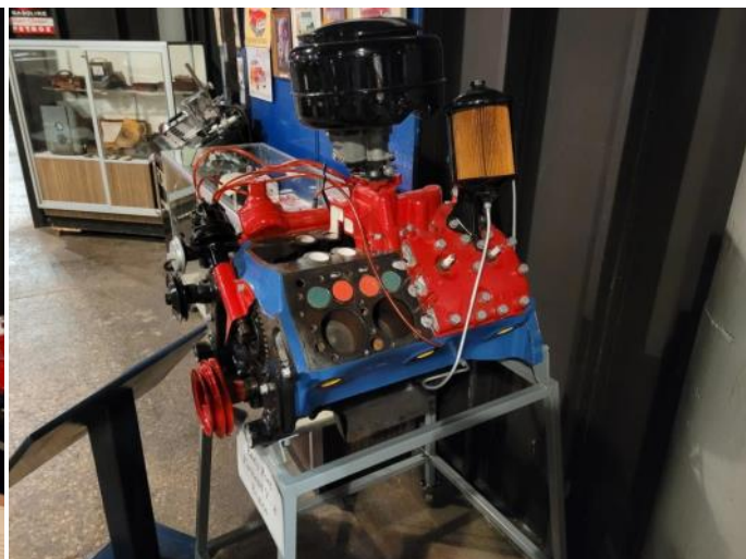
Museum exhibit from Badger State RG #35, cutaway V-8 on right