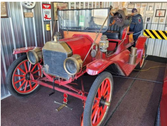
1909 Model T