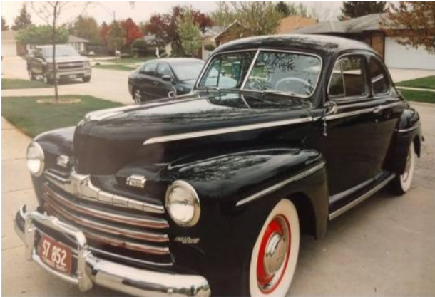
1946 Ford Super Deluxe Business Coupe