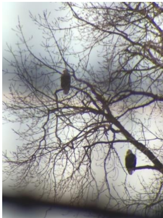
Many eagle sightings!