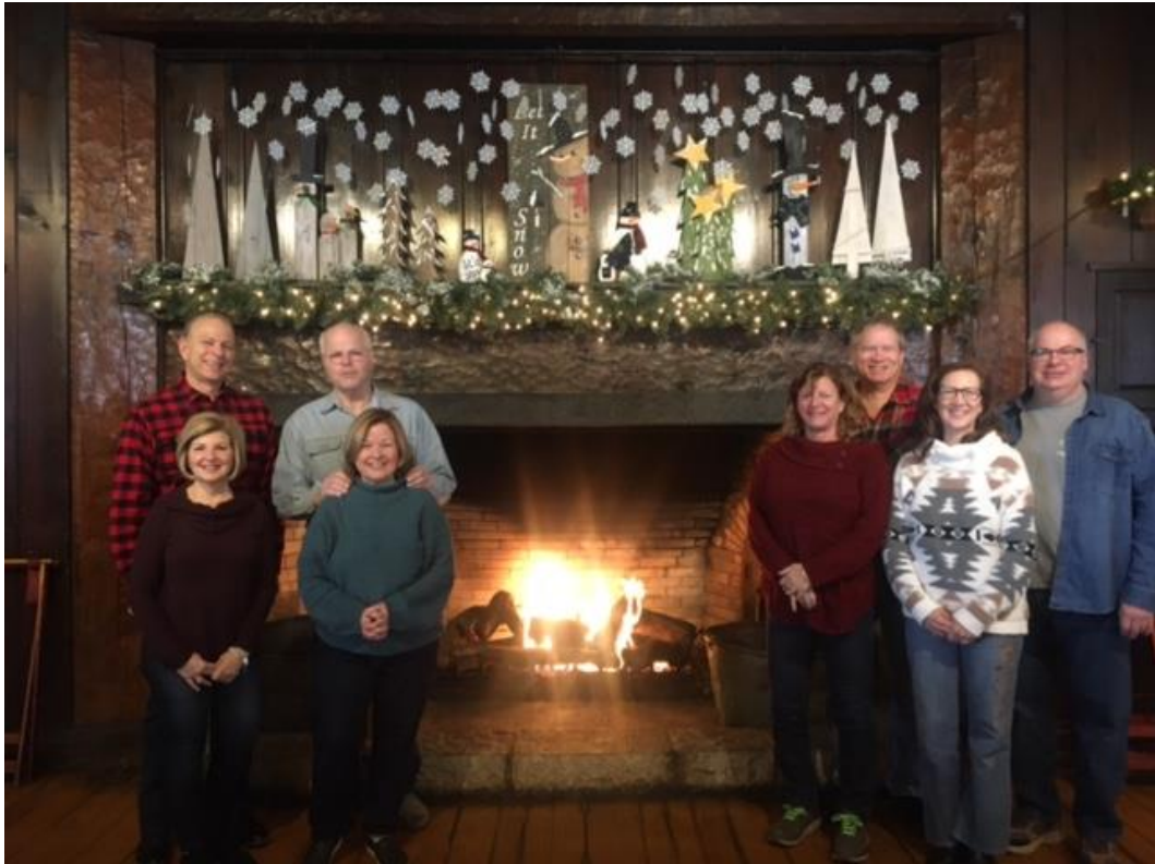
Photo of the Month NIRG Members and Friends at Starved Rock Getaway Weekend