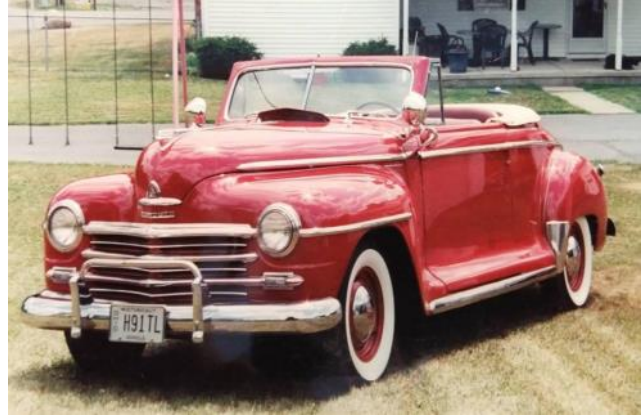
1948 Plymouth - P15 Special Deluxe Convertible