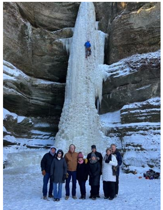
No one climbed the waterfall?