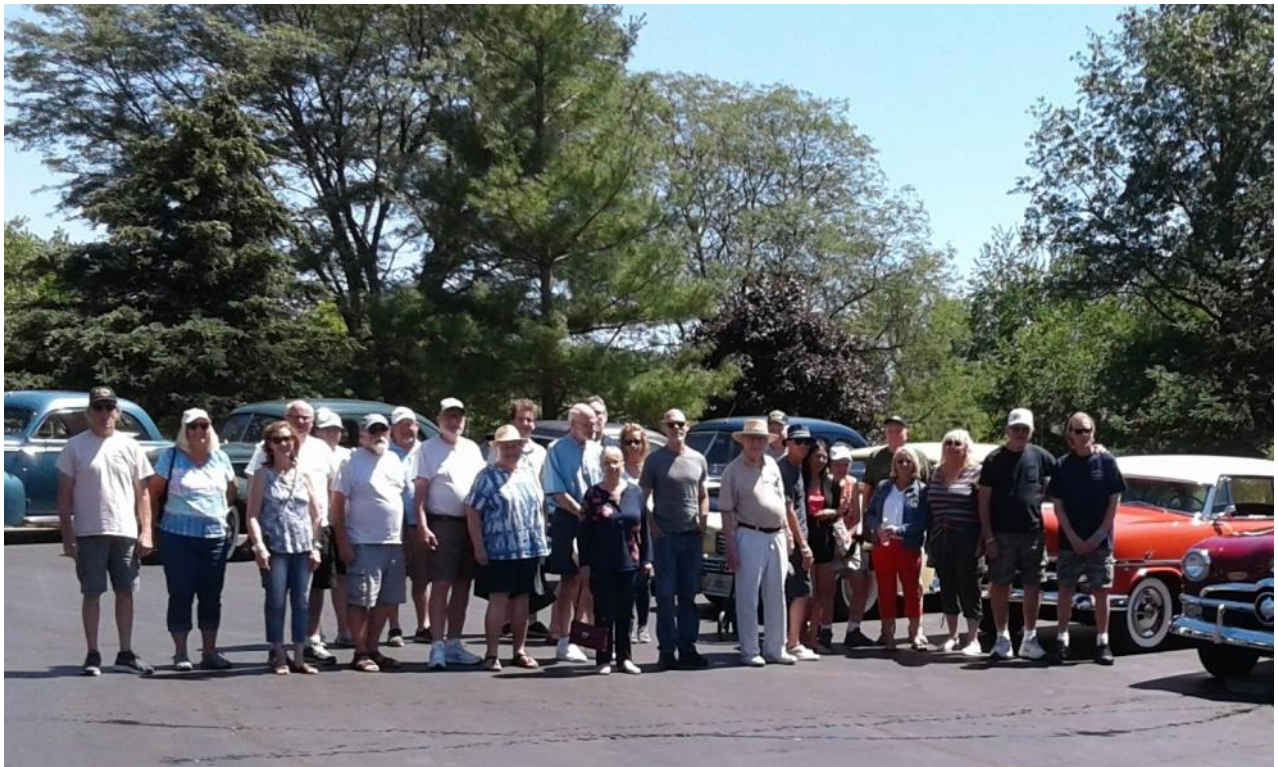
Photo of the Month Our Members on Drive Your Early V-8 Day Tour