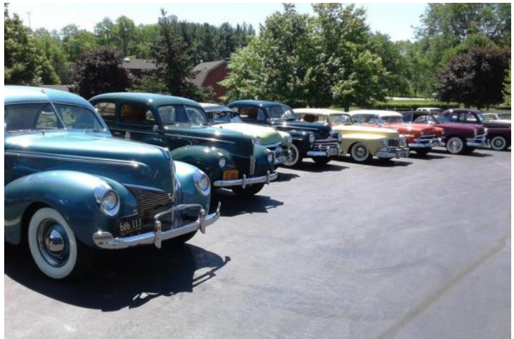
Above and below, the eight Early V-8's on the tour

There is so much to see in this museum that this article will never do it justice. But; I can tell you that no matter if one has visited it once, or