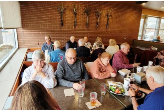
Our group enjoying a nice meal with great V-8 camaraderie