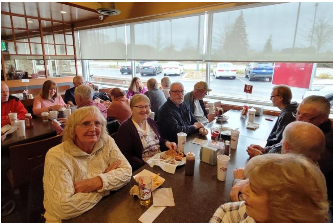
Photo of the Month Our Group at the V-8s and Veterans Luncheon