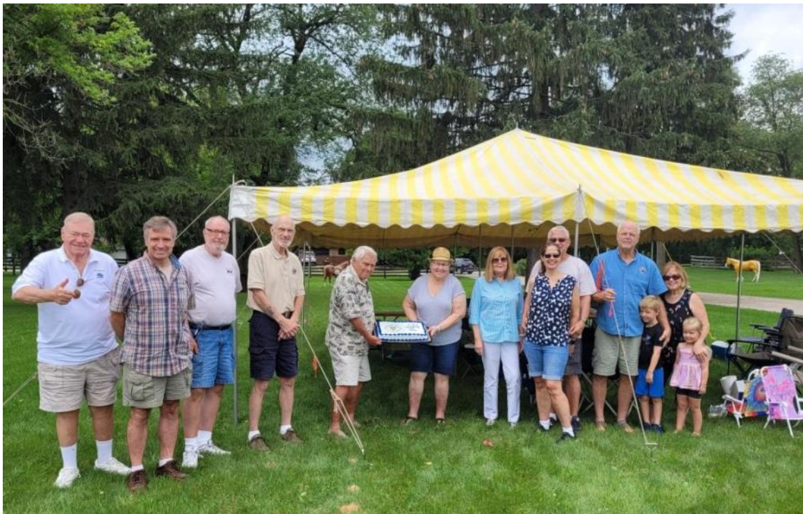
Photo of the Month Our Members at the 55th Anniversary Picnic