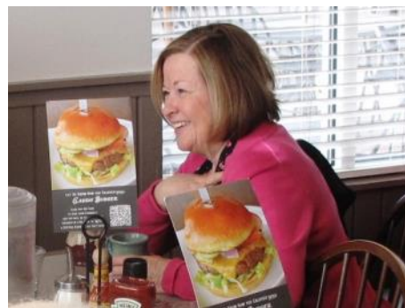
... and Colleen