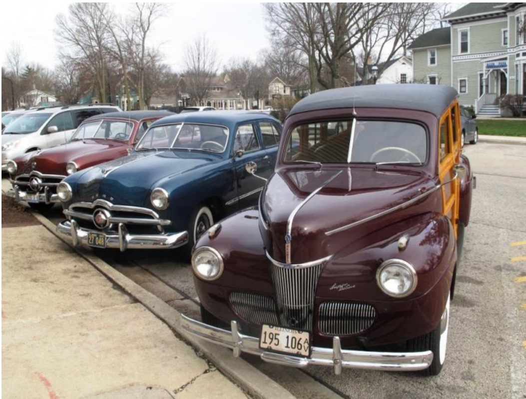
Photo of the Month Our Cars at the Eggs & Eights Breakfast Hosts Ron & Colleen's Station Wagon Up Front