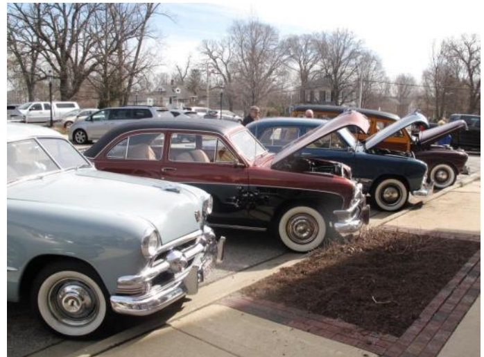
Our cars finally made it out for Spring