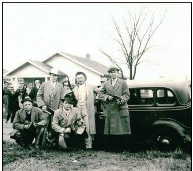
Oklahoma County Sheriff, Oklahoma City Police and Federal Agents who captured Wilbur Underhill posing by his stolen 1933 Ford V-8