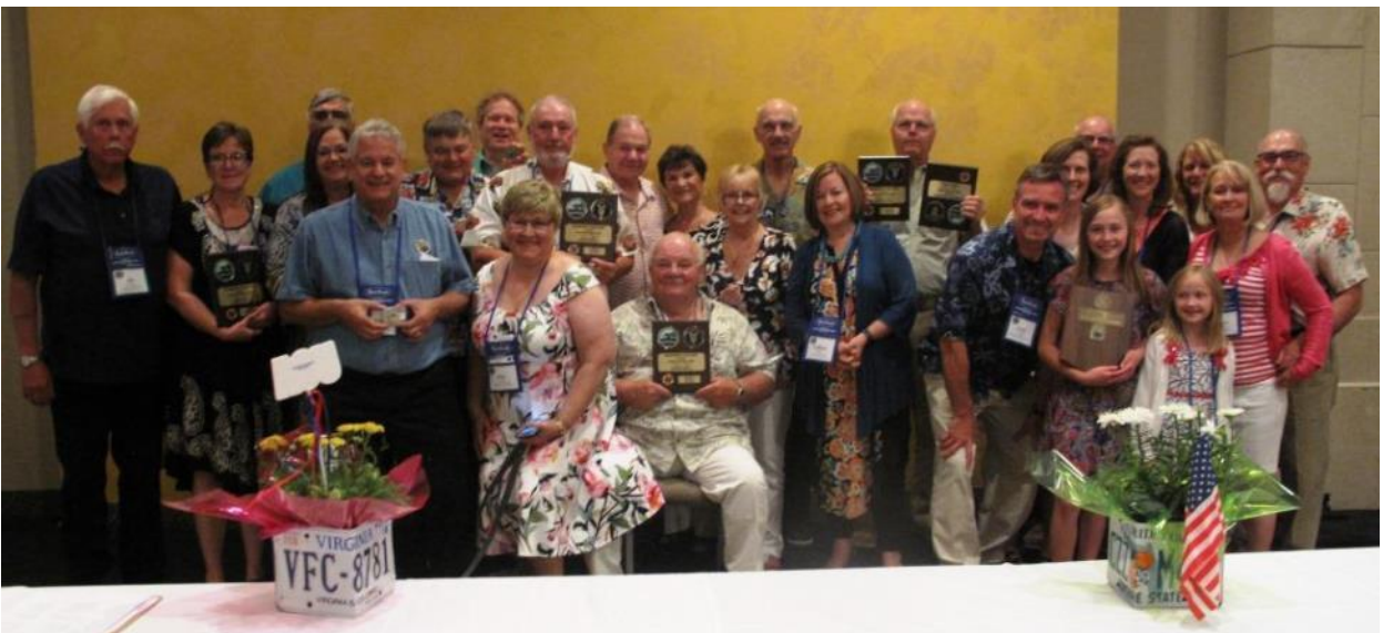
Photo of the Month NIRG Members at the 2018 Grand National Meet Awards Banquet