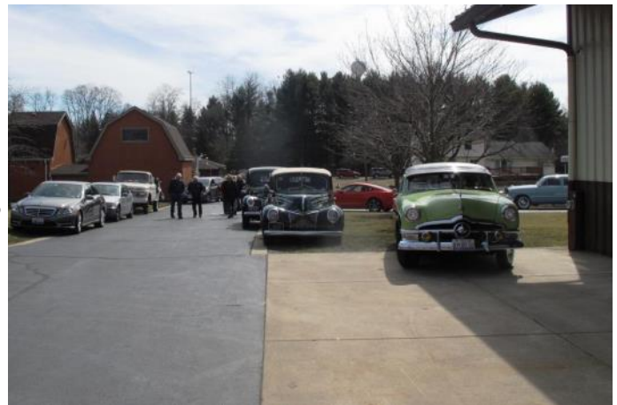
Some of our cars arrive at “Yockeytown”