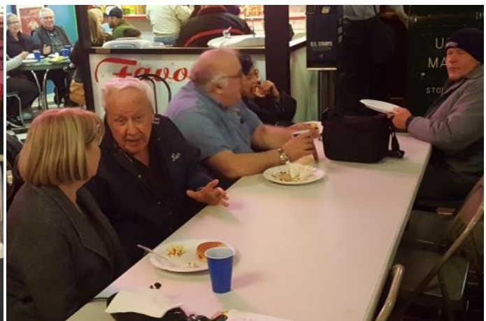
Enjoying the delicious lunch