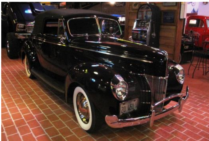
Beautifully-restored 1940 Ford Convertible