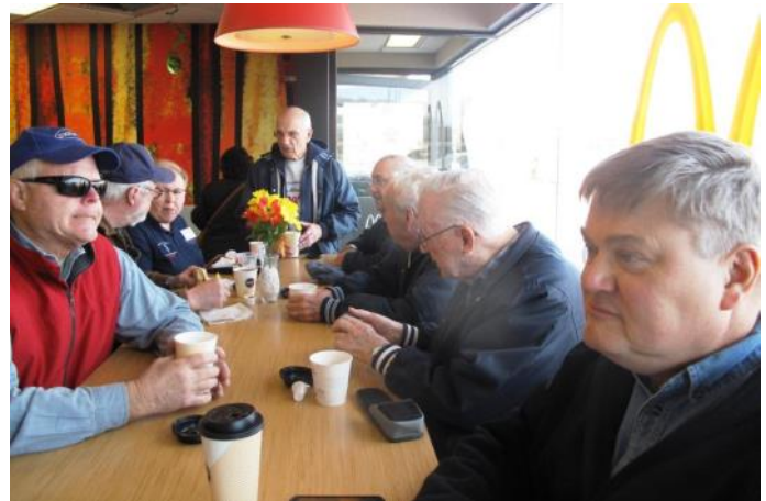
Members met for coffee before the tour

Of special interest to Ford V-8 enthusiasts were the beautiful 1940 Ford Deluxe Convertible and the