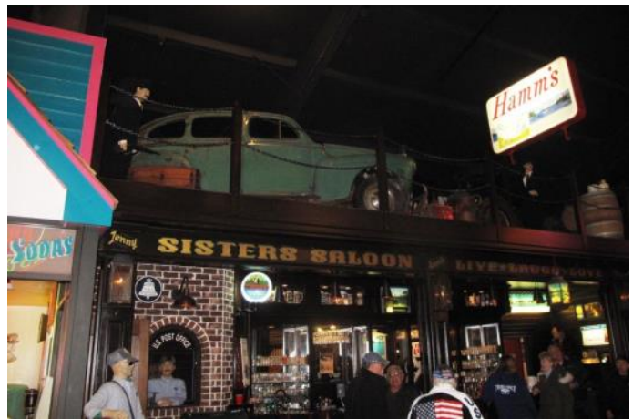
Must have been fun driving this one upstairs