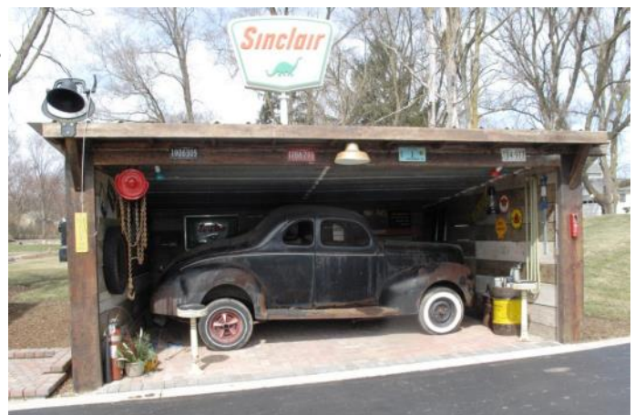
Is this '39 ready to be loaded with 'shine?