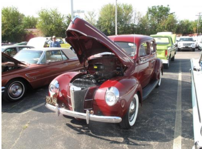
Ron Blum's '40