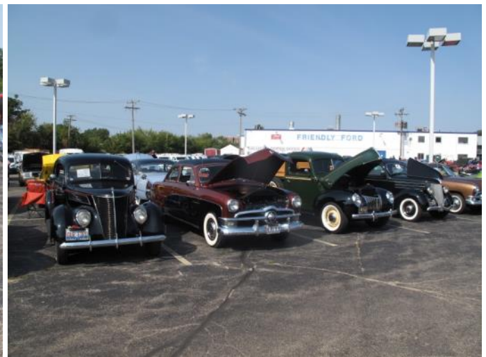
Some of the Early V-8s at the show