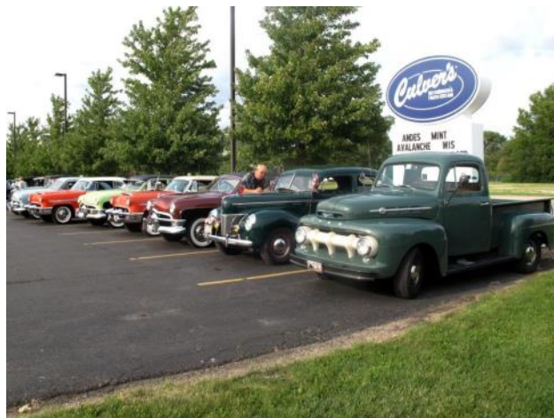
Our lineup of Early V-8s

As the event concluded, dusk settled in and participants fired up their V-8's and four bangers for the trip home. It seemed that members of both the car clubs enjoyed the opportunity to meet other fellow auto hobbyists and to see the cars that represent what went before and for others what came after their individual Ford Motor Company automotive pride and joy.