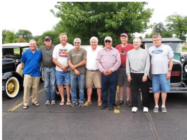
Some of the Model A owners