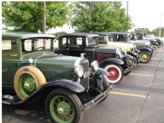
Lots of Model A's graced the parking lot