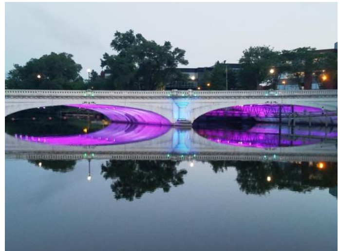
Beautiful arch bridge adjacent to hotel

Our trip home was uneventful – all the Early V-8s made the journey without incident. Our thanks to everyone who participated and we are already making plans for 2018.