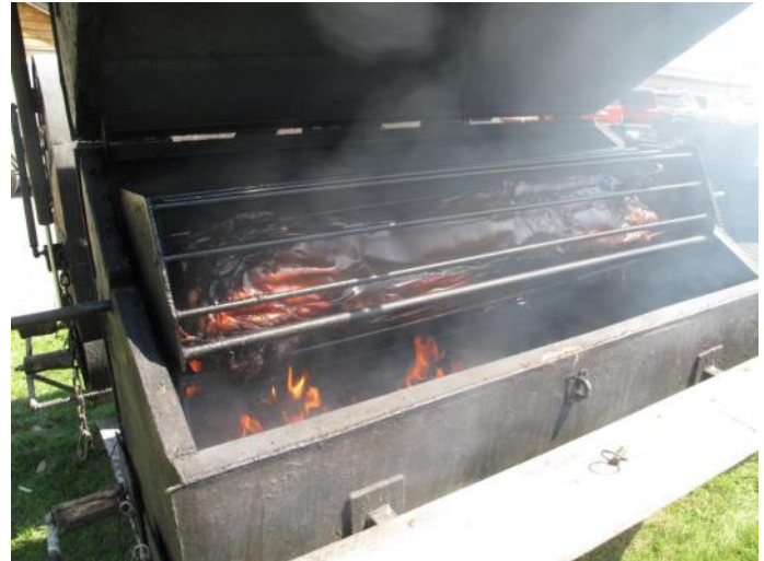
Almost ready - yummm