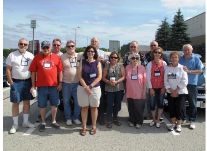
Gathering at the Lincoln Oasis