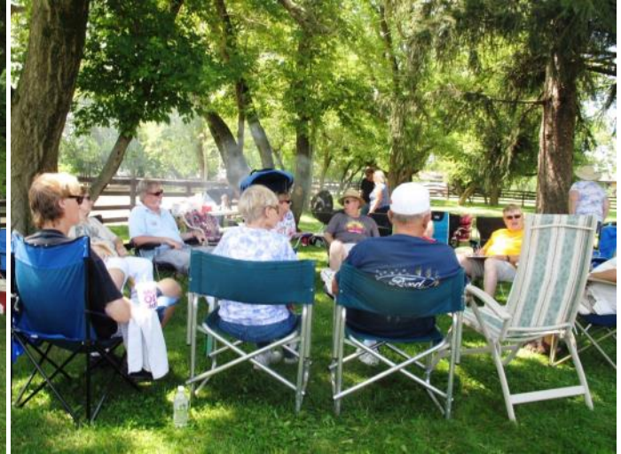
A small portion of the large crowd enjoying the day