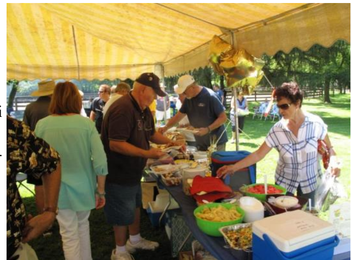
There was plenty of food for everyone