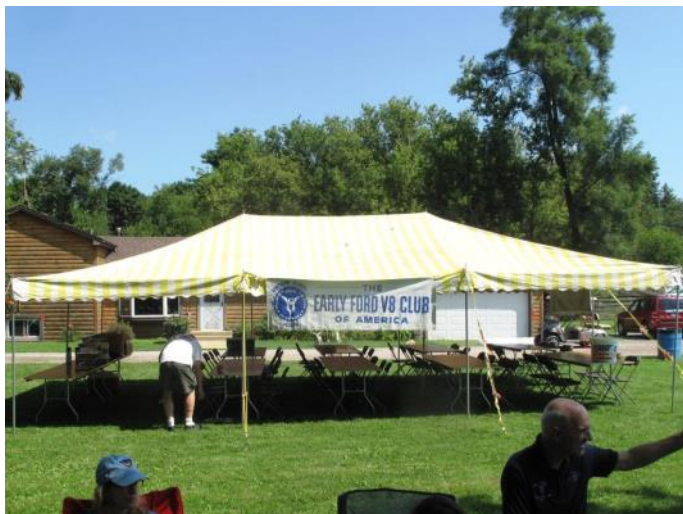
The tent went up with ease