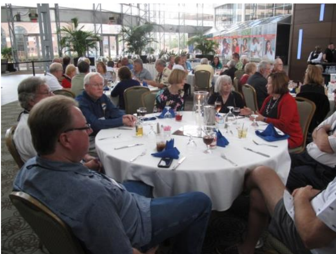
Dinner in the Doubletree Atrium