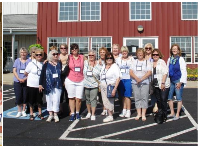
The ladies at Hostetler's Hudson Museum