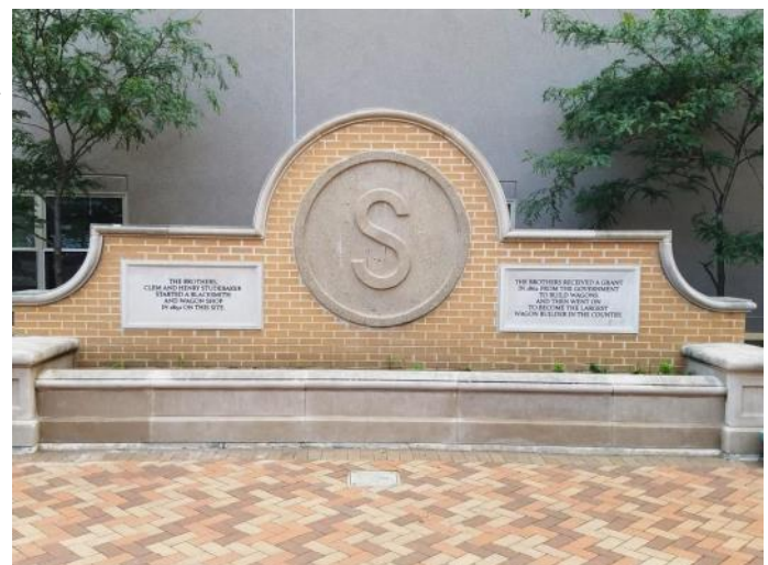
Marker at the Studebaker blacksmith shop site, downtown