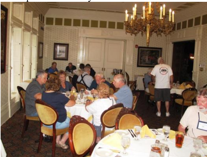
Dinner at Tippecanoe Place