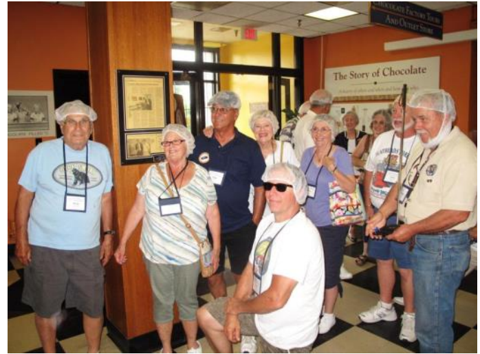
Sporting nifty headgear on the chocolate factory tour

After lunch we were off on the short drive across town to the Studebaker National Museum. We learned the history of the Studebaker family's arri-