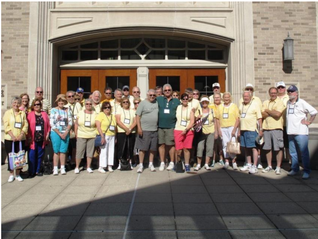
Photo of the Month “Yellow Shirt Day” on the Joint Tour with Northern Ohio