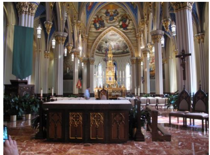
Inside the Basilica of the Sacred Heart at Notre Dame