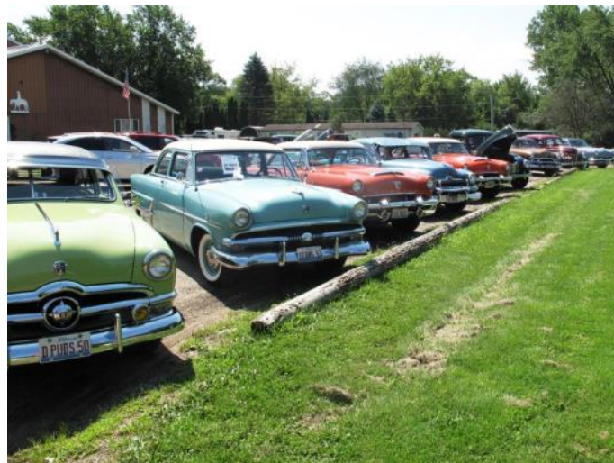
A few of our Early V-8s