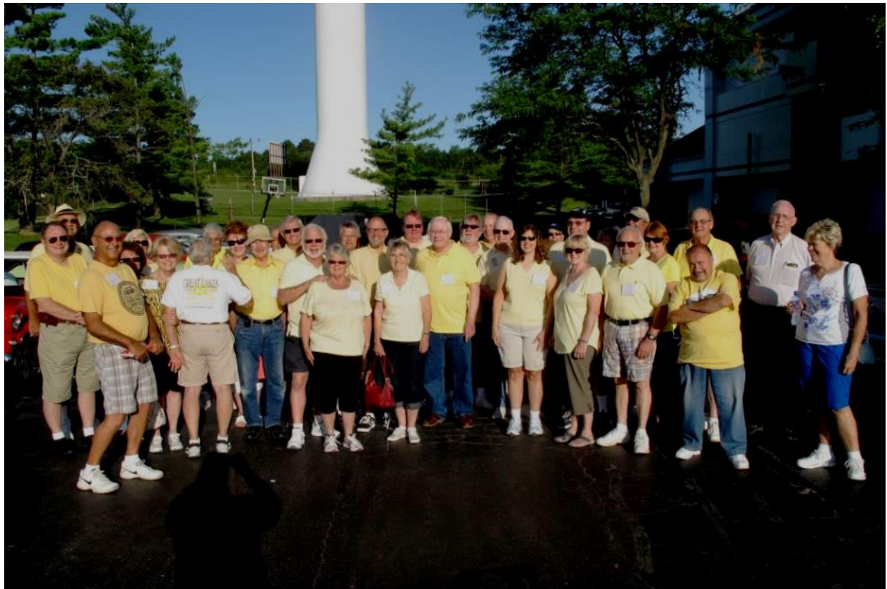
Photo of the Month “Yellow Shirt Day” in Dayton at the 5th Annual Great Lakes Rendezvous