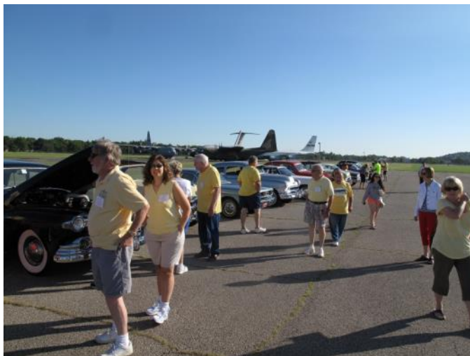
Arriving at the Museum of the US Air Force