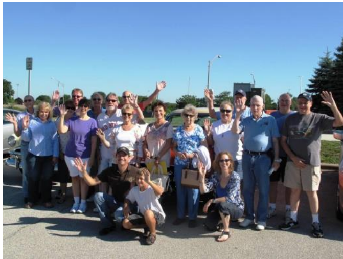
Ready to go at the Lincoln Oasis

Friday morning it was time for our driving tours to begin. Our long caravan of cars left the hotel for our