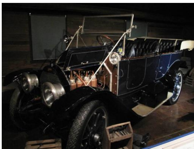
Exhibit depicting creation of the first self-starter

Dinner was on our own again Friday night and a few