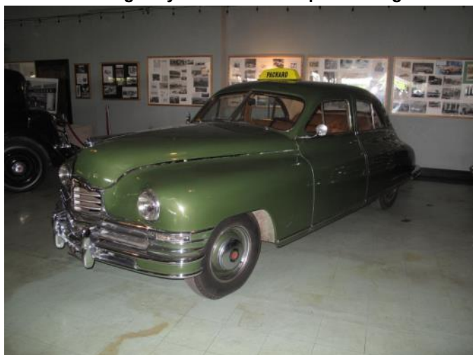
A Packard taxi - once common in New York City