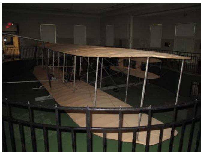
The original 1905 Wright Flyer