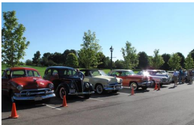
Our cars at the Doubletree in Dayton