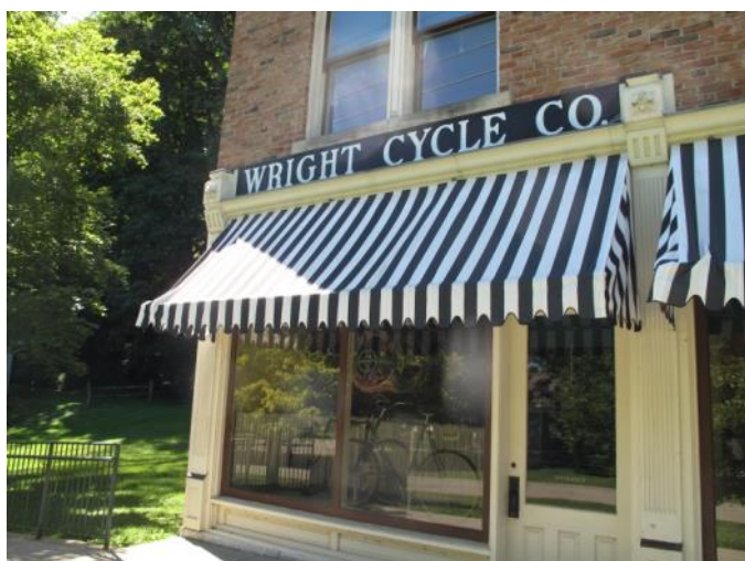
The Wright Cycle Co - the birthplace of flight