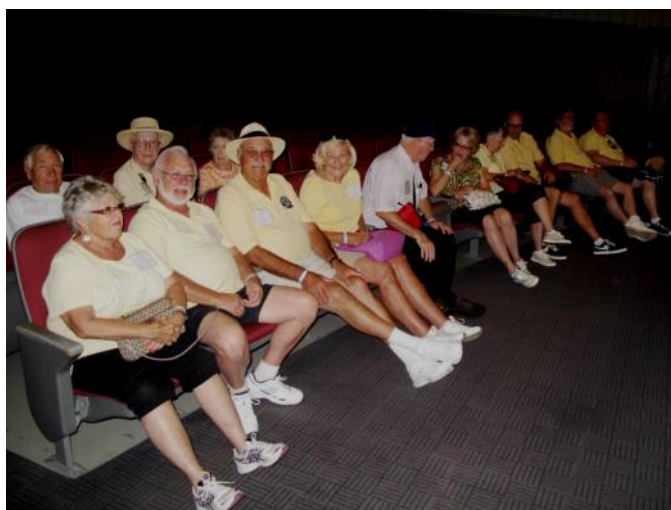
It was a sea of yellow at the museum