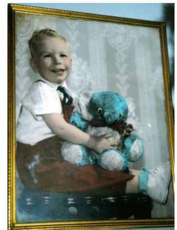
Who is this? See page 11

Insert – 2014 Dues are Due! Members should find an insert to pay your dues for next year.