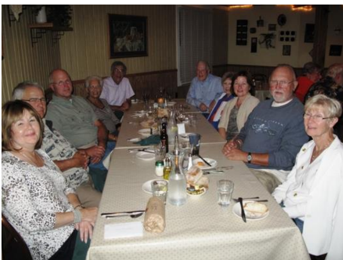
Dinner at Joseph's Steakhouse - awaiting the poker rally results