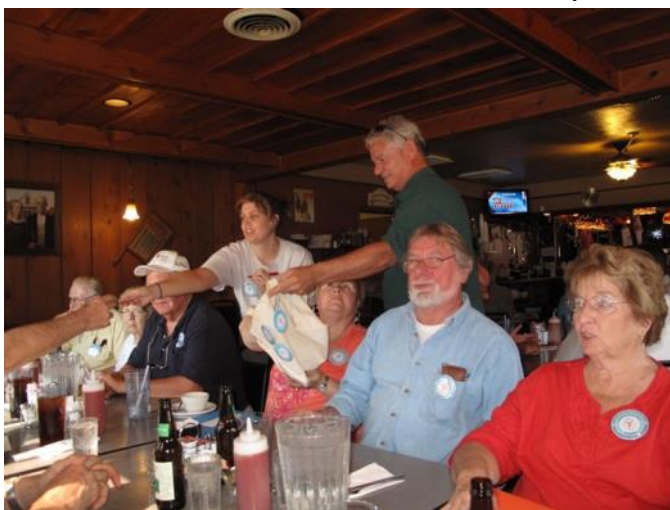
Drawing cards at Local Folks