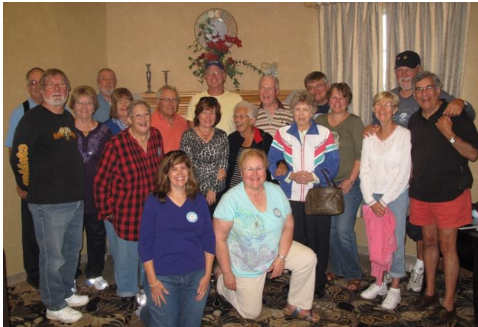
Photo of the Month Our Group at the 6th Annual Poker Rally