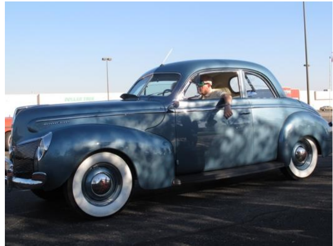
Tom tries blind toll booth