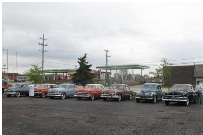
Some of our cars being inspected