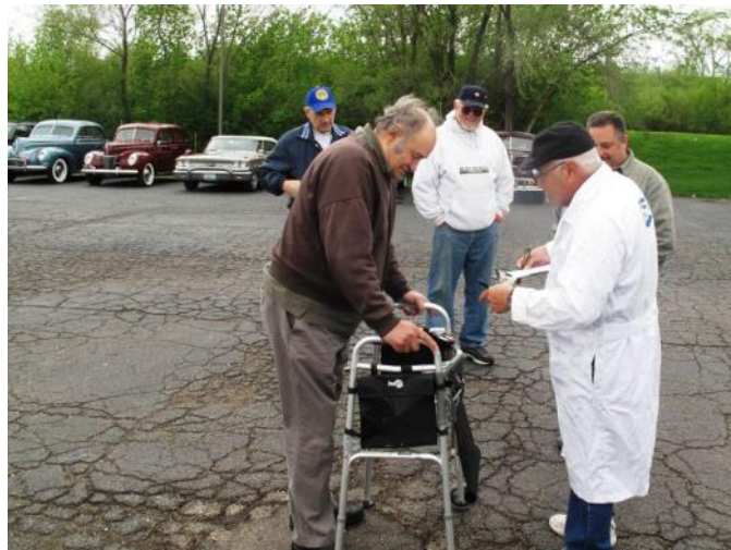
No conveyance escaped scrutiny