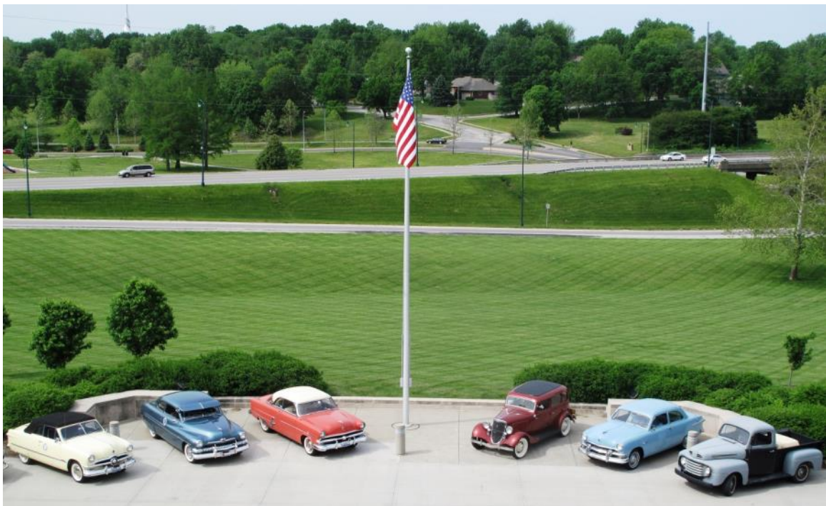
Photo of the Month Early V-8s at Truman Presidential Library and Museum