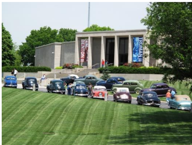
V-8s Displayed at the Truman Library