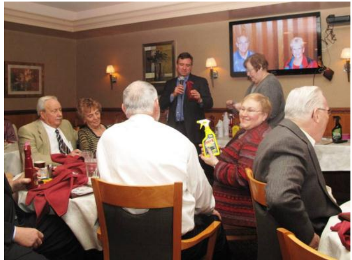
Everyone enjoys the door prizes

The Northern Illinois Regional Group wishes to acknowledge the generosity of the companies listed below for donating door prizes that contributed to the success of our installation dinner. These companies provide valuable services in keeping our cars on the road and we ask that you patronize them when possible.