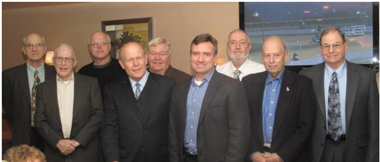
Photo of the Month 2013 Officers and Board of Directors Northern Illinois Regional Group