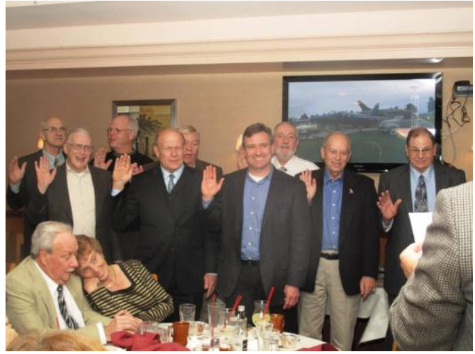
Taking the oath of office