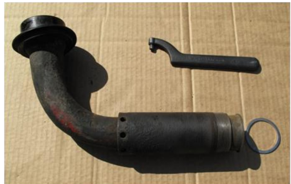
Filler tube, lead seal on right, spanner wrench above