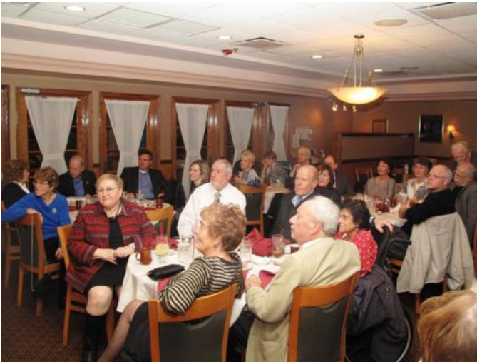
Part of the crowd