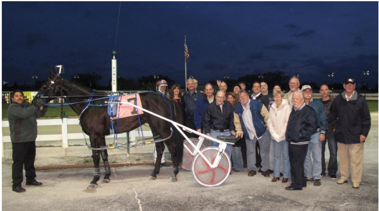
Photo of the Month NIRG Members Pose with Winning Horse and Driver