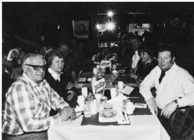
A Happy & Hungry Crowd ! ! ! !