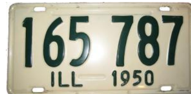
"Year of Manufacture" plate

As with the current Antique plates, Historical License Plates, representing the model year (commonly known as YOM, or Year of Manufacture plates), may be displayed on an antique vehicle licensed as