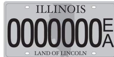
Expanded use antique plate

From the Secretary of State's website: Expanded-Use Antique License Plates have a staggered expiration and are annual plates. To qualify for Expanded-Use Antique Plates, motor vehicles, including motorcycles, must be more than 25 years old. Firefighting vehicles must be at least 20 years old.