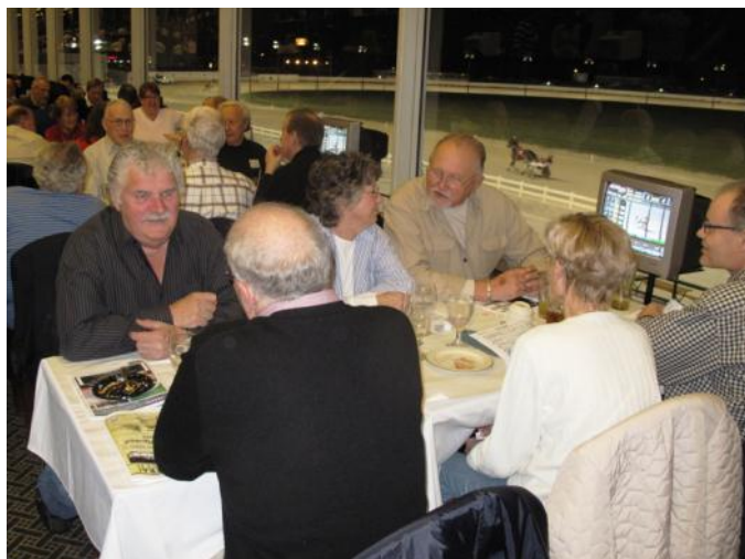
Part of our large group