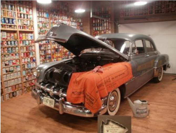
1950 Pontiac on display at the Pontiac-Oakland Museum

After a night at the Comfort Inn, which just became a Best Western, participants awoke for some last minute pictures down at the Route 66 Museum mural.