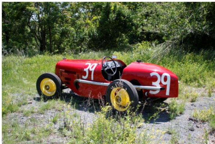
Ardent Alligator