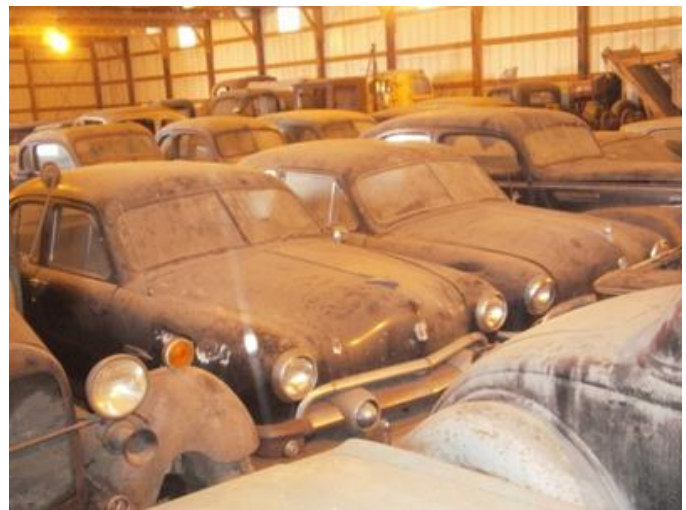
A pair of Shoebbox Fords ('51 & '50)