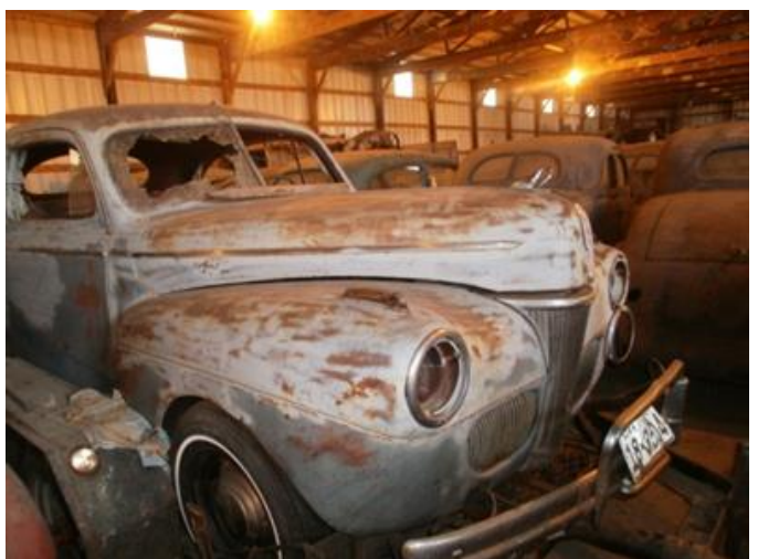
This '41 Ford needs some TLC