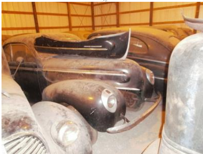
Where have we seen a '40 Mercury Sedan Coupe before?