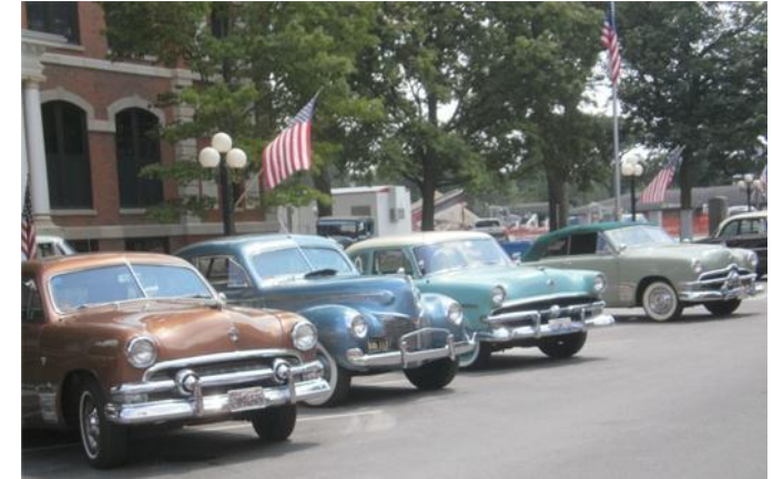
NIRG V-8s at the Courthouse

The rest of the afternoon offered opportunities to visit the Route 66 Museum, the Military Museum and the Mural Museum along with shopping and viewing the Mini Coopers displayed on the opposite side of the town square. As late afternoon approached the majority of our group headed back to the Chicago