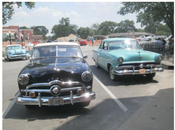
A couple of the Rockford Group's V-8s