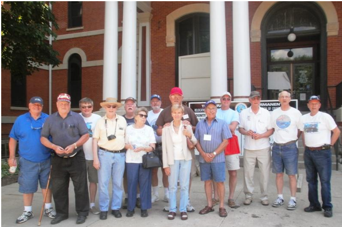
Photo of the Month NIRG Members at the Pontiac Joint Tour