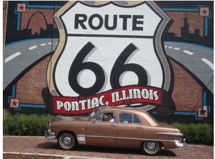
A quick picture at the Rt. 66 mural before leaving Pontiac