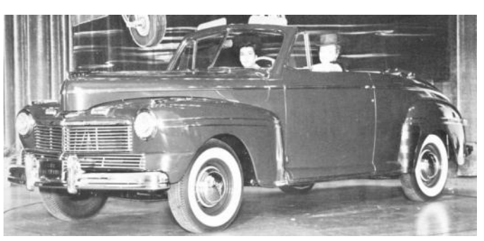
Rarest of All? Only 956 '42 Club Convertibles were produced, making it perhaps the rarest Ford or Mercury open car