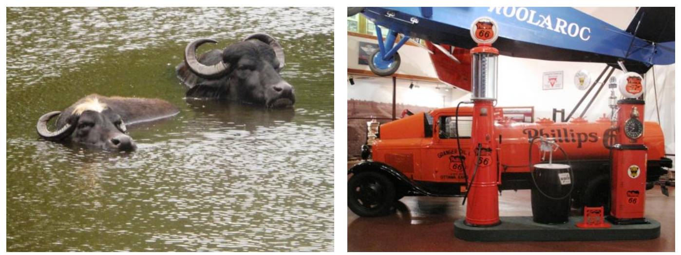
Water buffalo at Woolaroc

was founded in 1925 as the ranch retreat for Phillips 66 founder Frank Phillips. The grounds are filled with exotic wildlife; the museum has an outstanding collection of western art and artifacts, Native American material, firearms, and Phillips 66 memorabilia. The evening was again spent in the parking lot with plenty of lively discussion, not all of it about the flathead engine design.