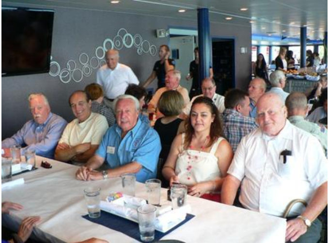
Above and below, V-8ers enjoying the cruise

Many of us then walked around the boat, enjoyed the nice cool breeze from the lake and the scenery. By then everyone had just about forgotten the ride in and were glad to be among our V-8 friends.