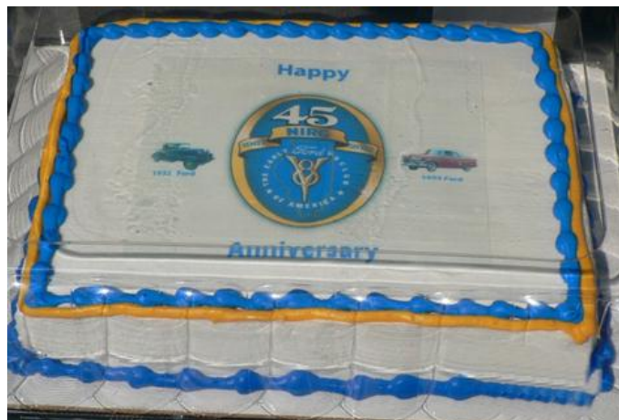
Happy 45th to the Northern Illinois Regional Group!