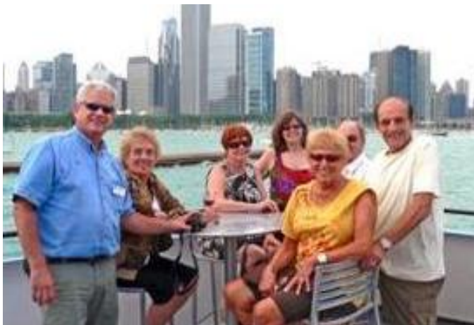
The weather on deck was spectacular