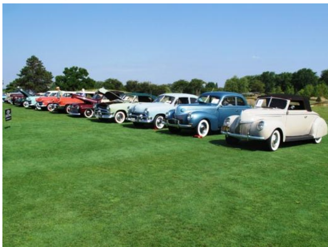
Our line of Early V-8s