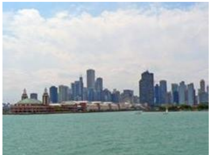
Fabulous Chicago skyline with Navy pier in foreground