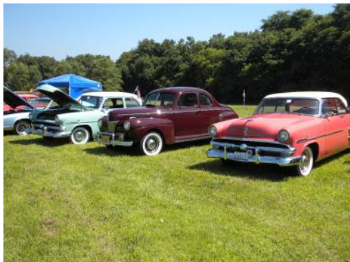
Three of the NIRG Cars