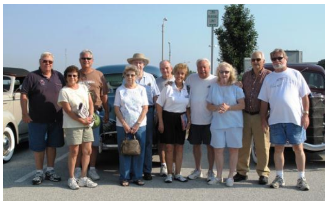
At the Lincoln Oasis, ready to go