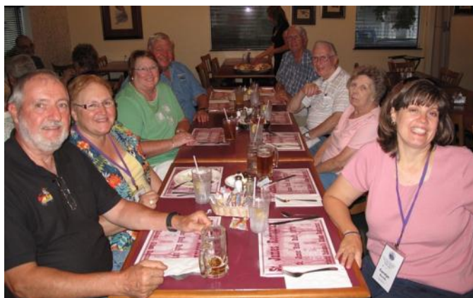
Our group dinner at St. James Restaurant

We hated to miss the Foundation Meeting, but time was tight. We had just enough time to return to the