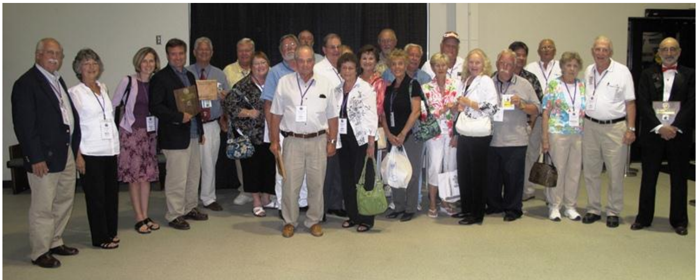
Photo of the Month Our Group at the Central National Meet Awards Banquet