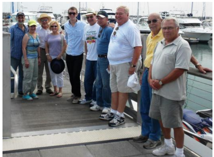
Part of our group at the harbor