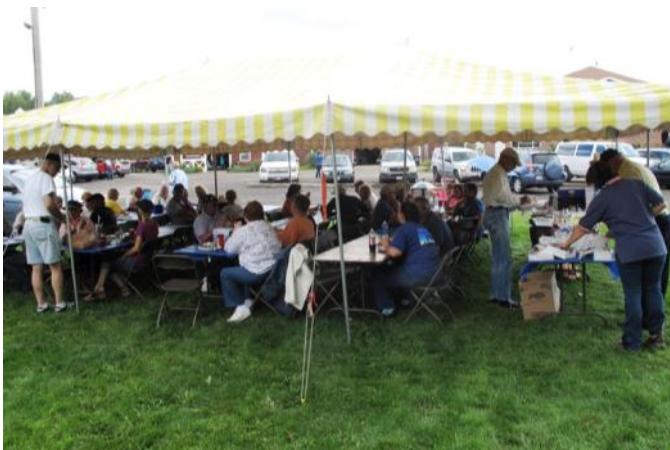
There was lots of food for everyone