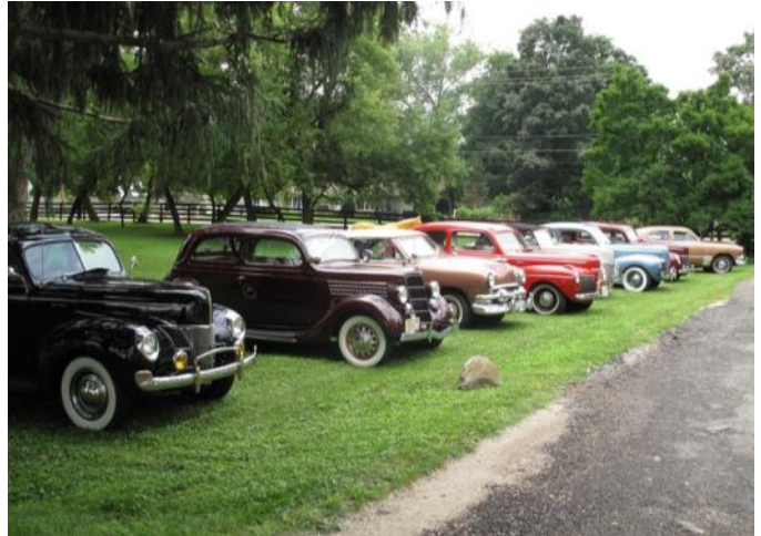
Above and below, some of the classics on display

There was plenty of time during the day to enjoy great conversation, to go out and kick a few tires checking out the beautiful Early V-8s, and to enjoy a nice equestrian presentation. A few of the children even got a chance to ride the horses. Before everything wrapped up, we had our 50-50 drawing. Seemed like the fix was in; Barbara Slobodnik pocketed $191 in a blockbuster raffle while the club took the rest. Congratulations! Before making their way home in their beautiful V-8s everyone pitched in to take down the tent, load up the tables and chairs, and clean up the property. It was a wonderful day of V-8 camaraderie. Our thanks go out to our gracious hosts, Art & Carol Timmerman and to Don & Elaine Braun for making the arrangements.