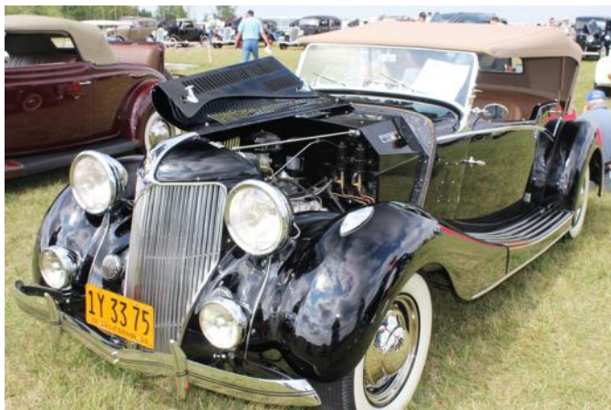
Incredible 1936 Jensen-bodied Ford, President's Choice