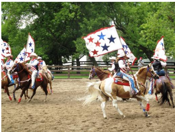
The riders provided lively entertainment that thrilled the crowd