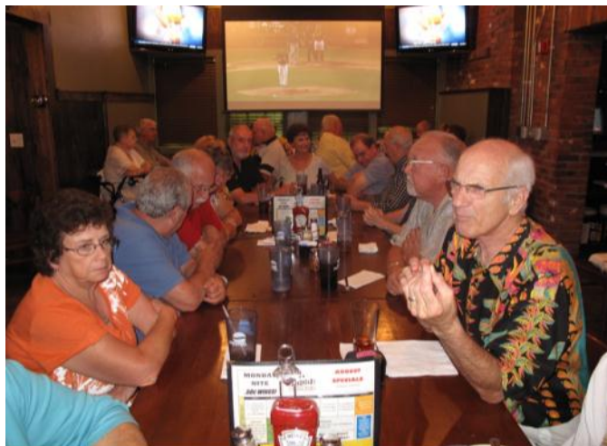
Part of the group at the drivers meeting