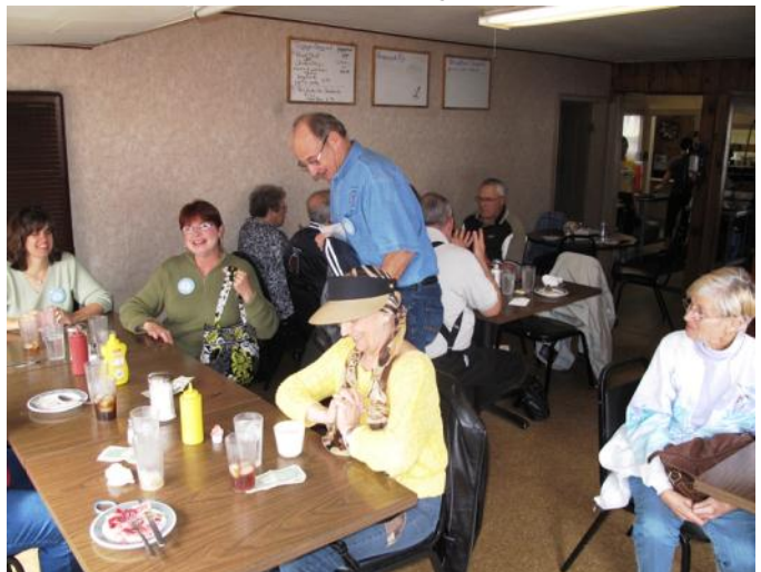
Lunch at Irma's Kitchen