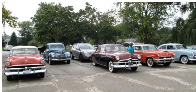
Our V-8s at Millie's