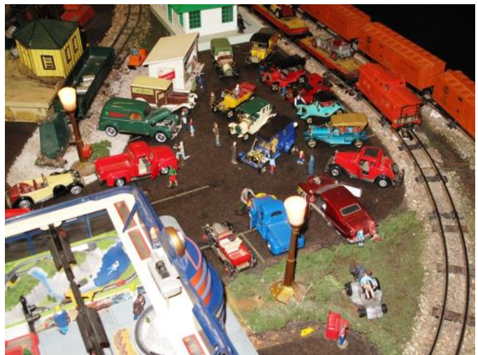
One of the animated displays was a car show