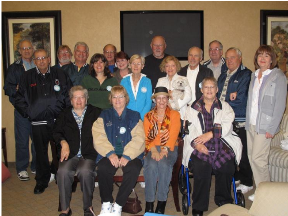
Photo of the Month Our Group at the Lake Geneva Poker Rally