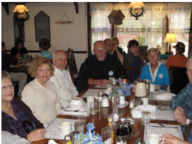
Breakfast at Millie's