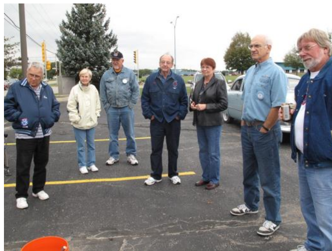
Watching the car games