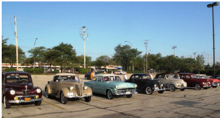
Our cars lined up to begin the tour

Stan led our caravan out Route 14 toward Roscoe; at a pit stop near Harvard we were joined by Bill & Marty Valters in their '40 Coupe.