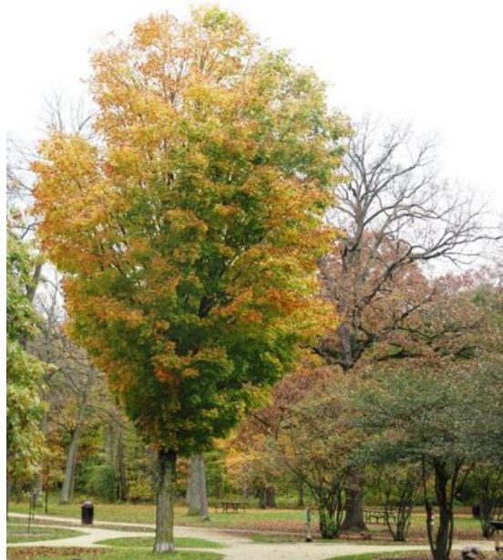
Many of the trees were spectacular