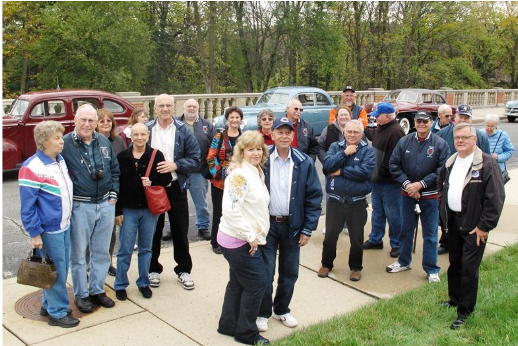
Photo of the Month Our Group at Mundelein Seminary