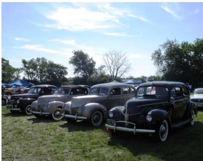
Some of our cars at the show

There were a lot of nice cars to see at the show and most of the group also toured the museum after finding something to eat at one of the food vendors. Much of the time we were looking for some shade to sit in as it was a rather hot day. At noon there was a patriotic ceremony commemorating September 11. By 3:30 most of the participants were heading home in smaller groups. We thank Stan for organizing a nice tour and thank the participants for contributing to a worthy cause.