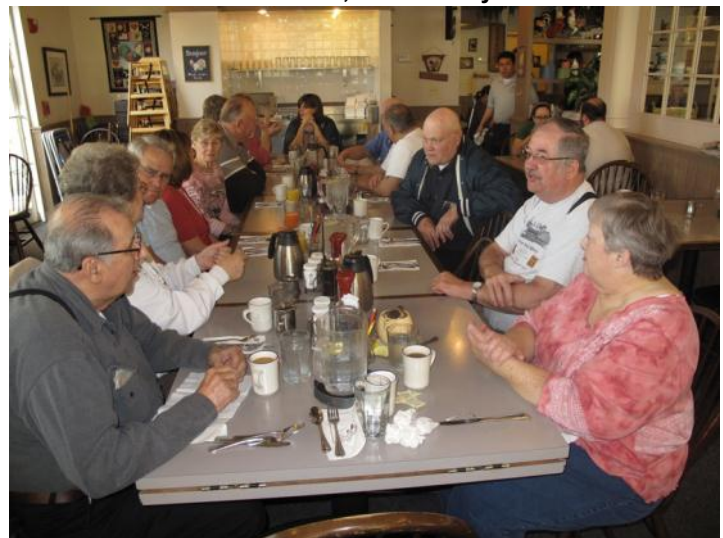
V-8ers always enjoy a good meal!