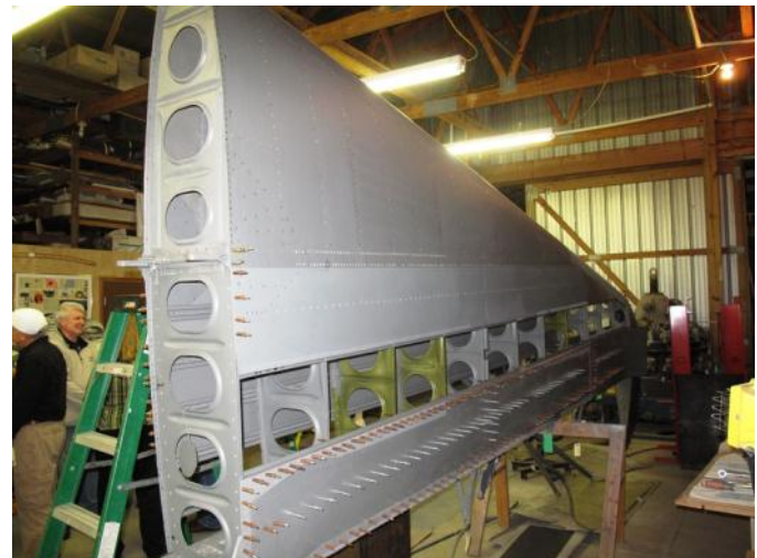
Progress on the elevators