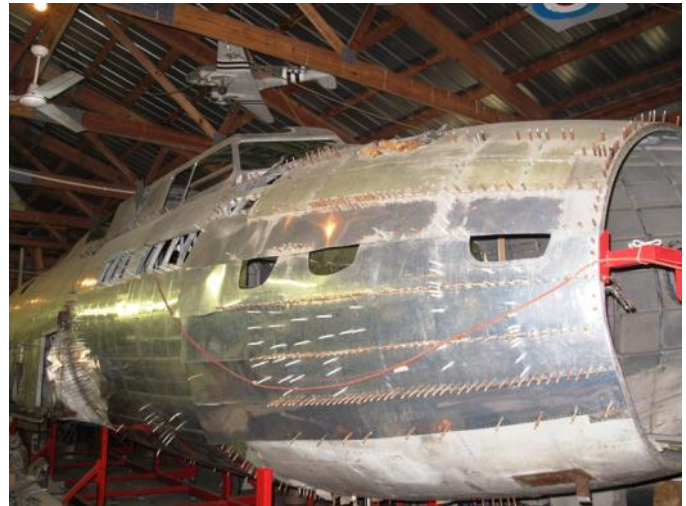
The B-17 Fuselage

We were all on our way home by 1:45 p.m.