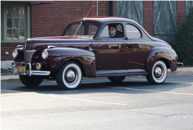
Joe Serritella's super '41 Coupe