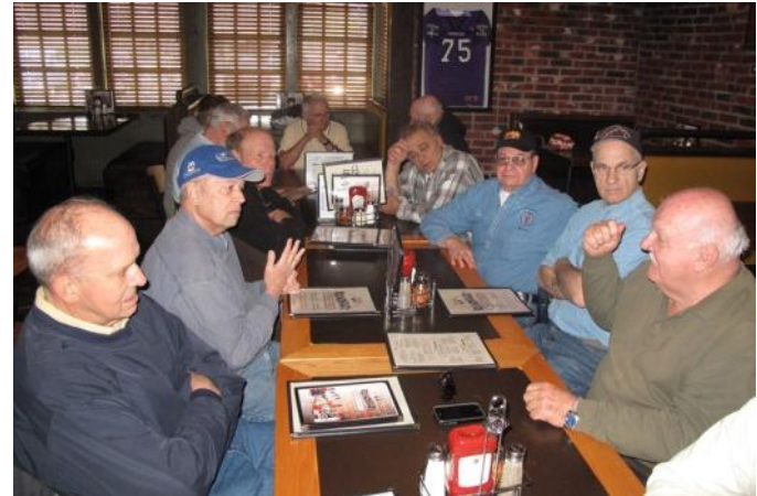
Lunch at Roundhead's