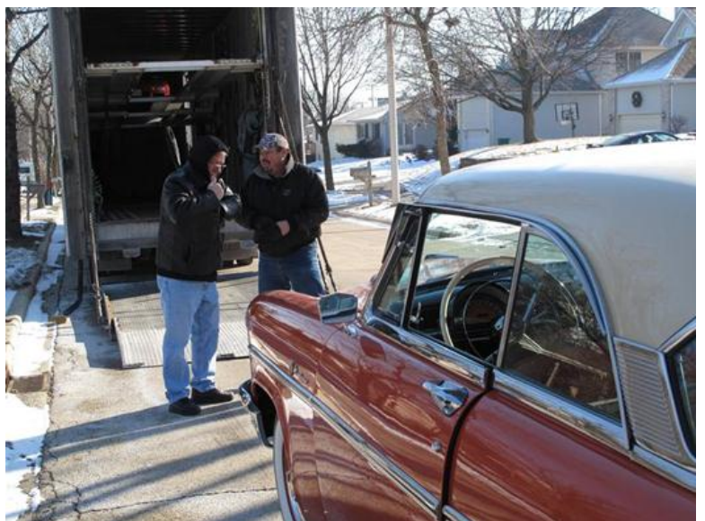
On a cold winter's day, the Merc arrives