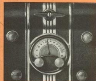
The beautiful, indirectly lighted radio dial fits into the instrument panel, in the opening ordinarily occupied by the ash tray. Matches other instruments in appearance.

$44.50 INSTALLED Convenient Universal Credit Company Time Payments Open Cars—Antenna Extra