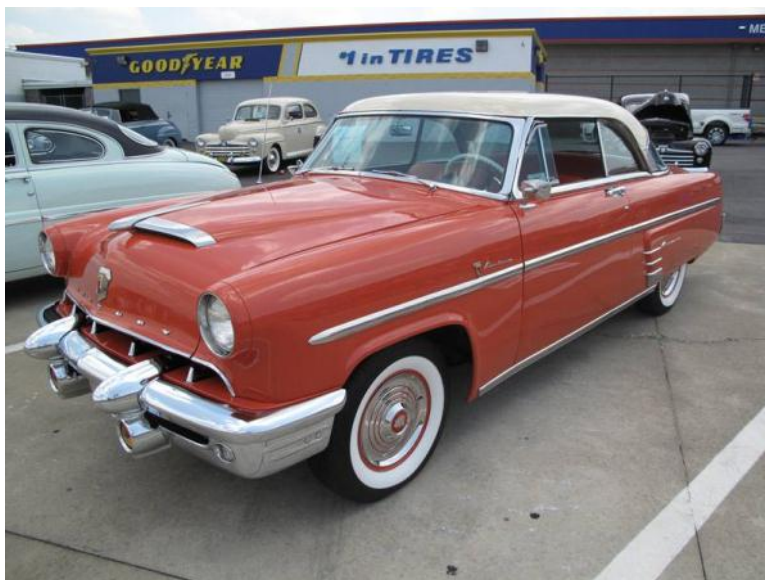
On the concourse in Charlotte