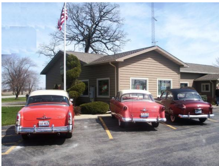
One of several Bristol cruises