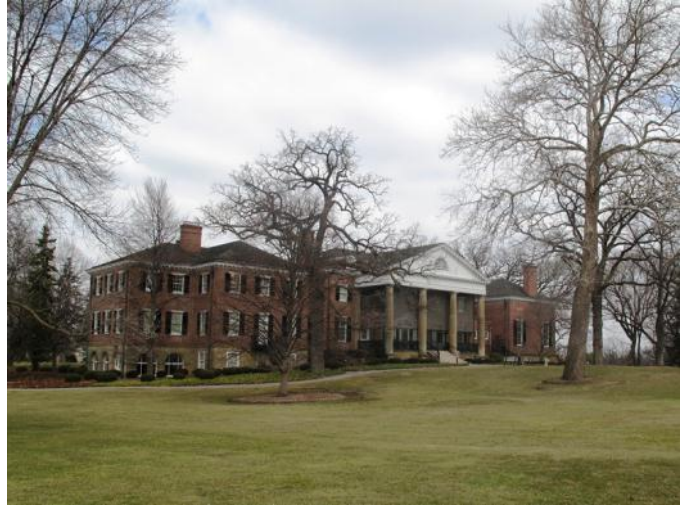
Robert R McCormick Home & Museum

As the other group began their tour of the First Division Museum, we walked over to Robert R. McCormick museum, which was built as a country home for McCormick's grandfather (shown on the right). McCormick first used the house as a summer home, then greatly expanded it and used it as a permanent residence. After McCormick died in 1955, his will established the Robert R. McCormick Foundation, which permanently maintains Cantigny Park. Our knowledgeable tour guide took us through most of the house, showing us how a wealthy person lived in the first half of the 20th century and detailing many stories of how the rich and famous of the day were entertained at the home. This mansion had some incredibly modern conveniences for its day; seeing it should be a must for anyone who has the opportunity.