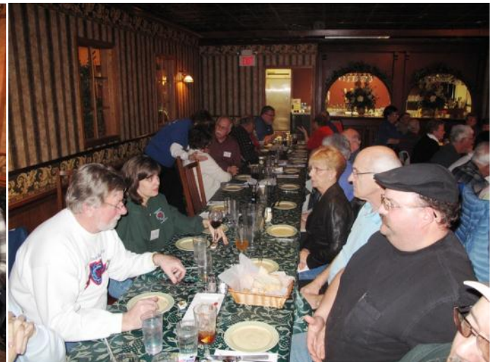
Enjoying food, drinks, and great company at Barone's