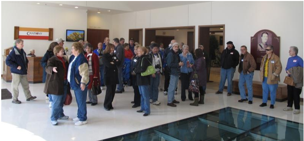
Photo of the Month Our Joint Group Gathers at Cantigny Visitors Center