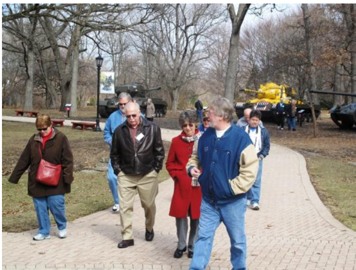
Exploring the tank farm at the 1st Division Museum

present. History is told in the form of weapons and artifacts, photos, period narratives, and much more. Robert R. McCormick, the late editor and publisher of the Chicago Tribune, served in the First Division and renamed his estate Cantigny (pronounced Can-tee-ny) in honor of the Division's first battle in France. There was a lot to see and our only problem was lack of time.