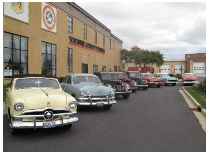
Our V-8s at Wisconsin Automotive Museum

As we entered the Museum we were wowed by a huge Lionel train layout. We were offered a short film on the history of Kissel then began viewing the extensive two-floor collection. The museum contains a large number of outstanding examples of the rarely seen Kissel. There are also display areas dedicated to the Nash and to the Hudson as well as displays of automotive artifacts, industrial engines,