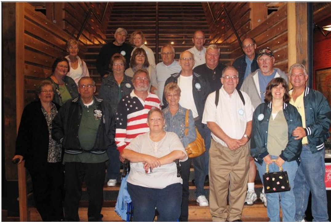
Photo of the Month Our Group at the Wisconsin Automotive Museum