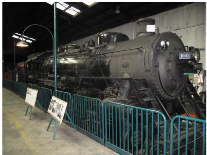
The mammoth Soo Line 1003