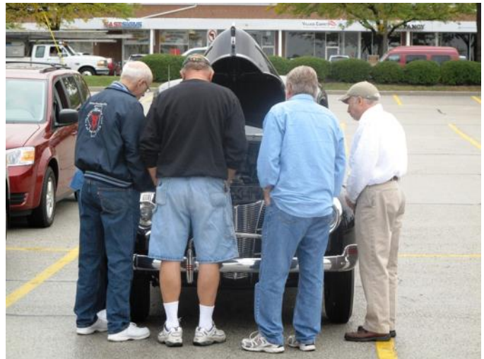
The experts examine the new Coupe