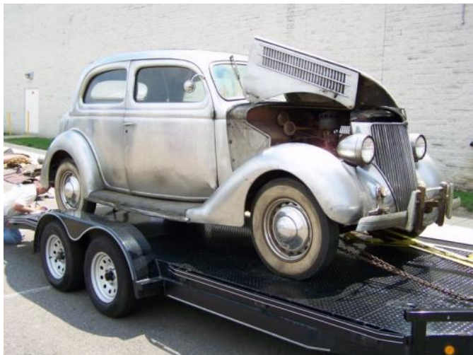
Before: 1936 Stainless Tudor in Dearborn, July 2008

Sunday – Concourse Day – arrived partly sunny, but very chilly for the end of August. We drove down early to the display grounds adjacent to the Early Ford V-8 Foundation Museum, got our cars situated, and completed final detailing. Several members of our group had volunteered to help assist other participants with parking their cars on the concourse. Boy, did our feet get wet running around in the tall, damp grass. The concourse was laid out very nicely, with judged cars in order at the front, all the Touring and Touring A cars, by class, next, followed by the Display Class. The concourse field was huge with over 200 vehicles present. What a terrific group of Early V-8's. One of the highlights was the stainless '36 Tudor that many of us had seen, in very sad shape, on a trailer at Dearborn last year. In just one year, this ultra-rare, one of four, V-8 had been restored to its former glory. Owner Leo Gephart received a Dearborn award for the car. It was a pleasure to talk to Mr. Gephart on the concourse and back at the hotel and to hear his many interesting stories.