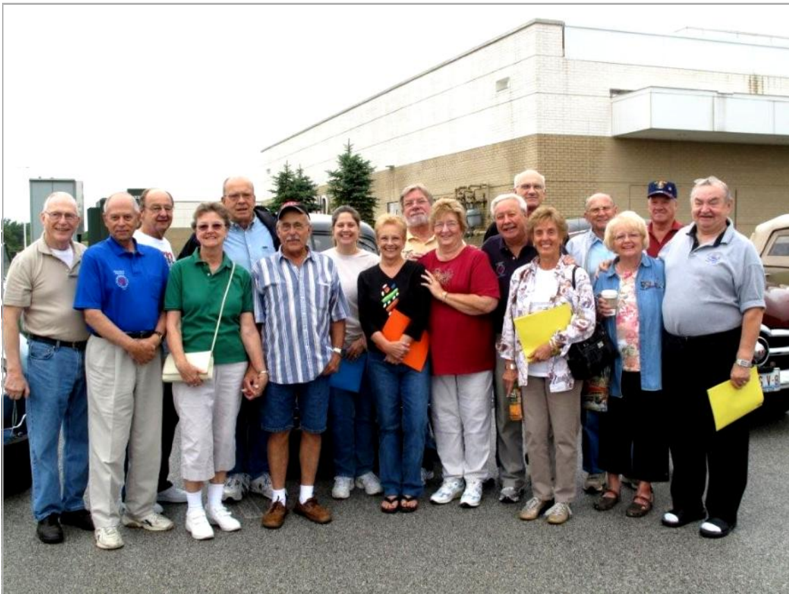
Photo of the Month Leaving for the 2009 Central National Meet