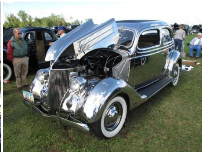
After: Same car in Auburn, August 2009