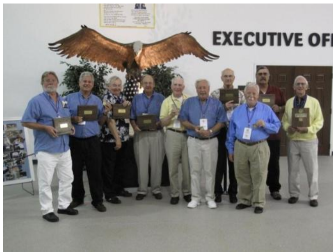
The Award Winners

A year of planning and anticipation comes to an end all too quickly. After the last award is presented and the owners of point-judged cars scramble for their tally sheets, there is never enough time to say goodbye to all your V-8 friends. But the time had come and say goodbye we did. We hope to see many of them again next year, but the 2010 Eastern National Meet in Charlotte is only a glimmer and no meets are yet scheduled for Central or Western. We would like to say "Thank You" to all the folks who worked tirelessly to put on a terrific National Meet. We know that it takes a lot of dedicated people to pull off an event of this magnitude. Your efforts were quite successful and are greatly appreciated.