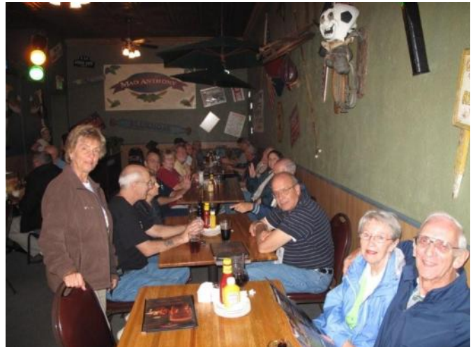
Dinner at Mad Anthony's