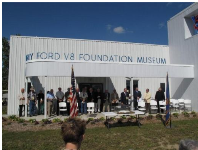
Dedication of Early Ford V-8 Foundation Museum

Tuesday afternoon brought a long-awaited event: the dedication of the Early Ford V-8 Foundation Mu-