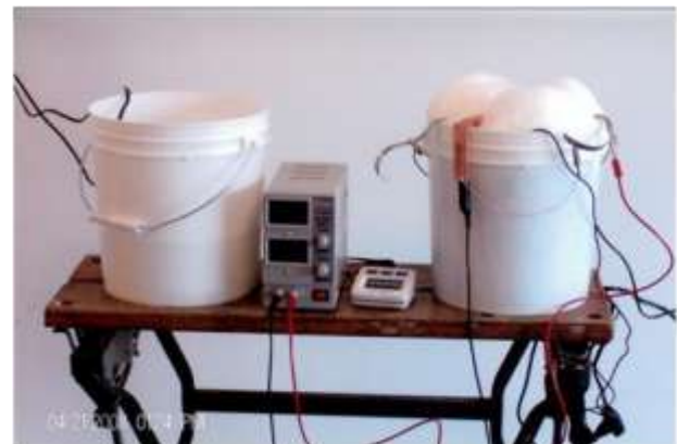
The plating tanks in operation