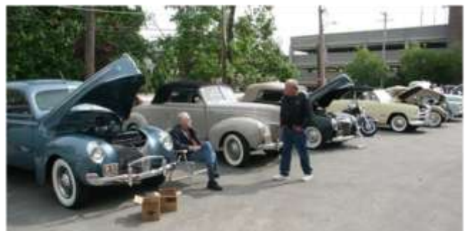
Oak Park Show

May: This was an action-packed month! It started out on May 3 when nineteen NIRG members enjoyed Ladies Night Out at the Pheasant Run Resort in St. Charles for dinner and a play, "I Love You, You're Perfect, Now Change." Our touring season