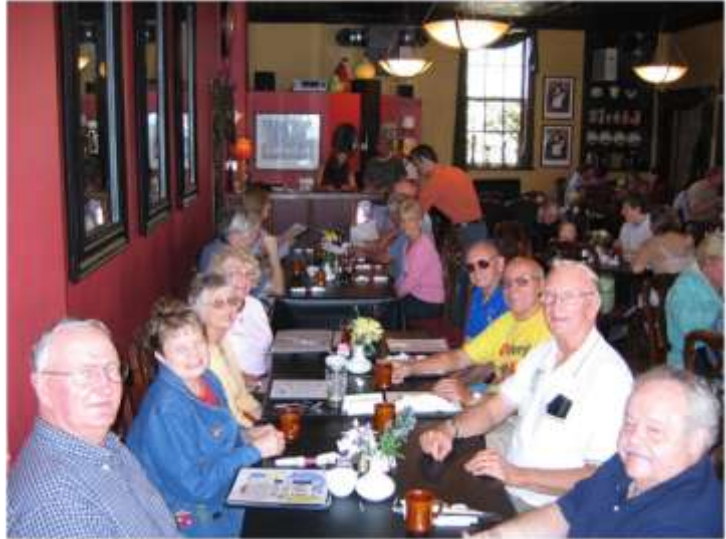
Luncheon in East Troy, WI

December: The year wrapped up with the annual Christmas Brunch at Drury Lane with 27 members and family in attendance.