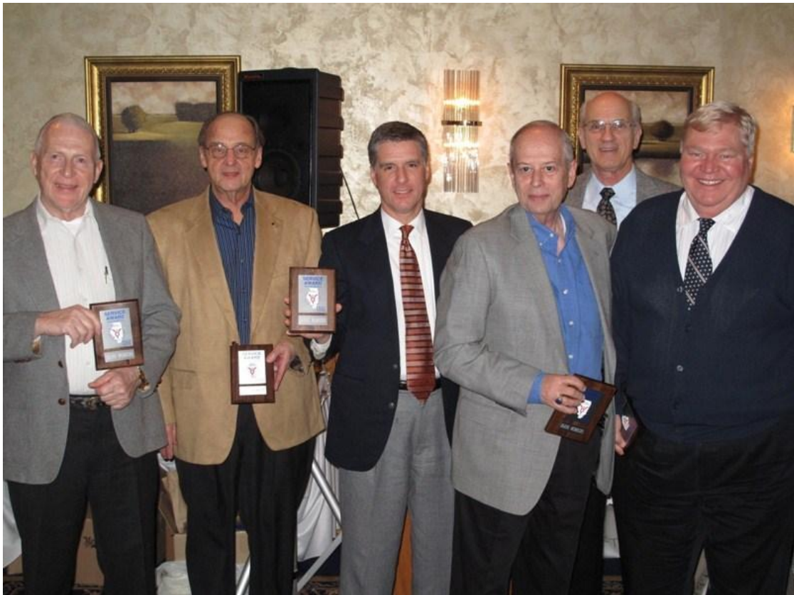
Photo of the Month 2008 Board of Directors