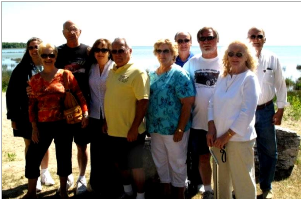
Photo of the Month V-8ers on Washington Island