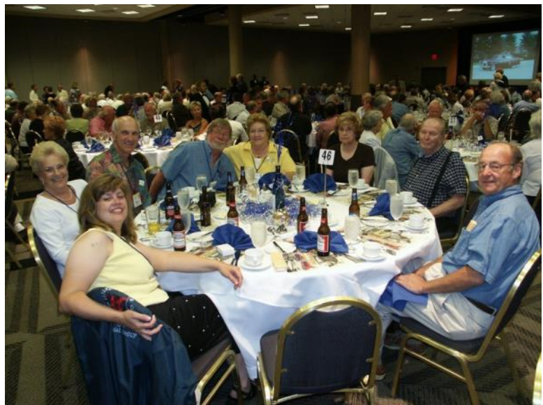
The Grand National Awards Dinner

Another Grand National Meet is behind us. These special events happen only once every five years and 2013 sure seems like a long time in the future. So, for the next four years we have no choice but to get our annual "fix" at the Central, Eastern, or Western National Meets. Next year's Central National Meet is just around the corner: August 28 – September 1, 2009 in nearby Auburn, Indiana. It is not too early to pre-register!