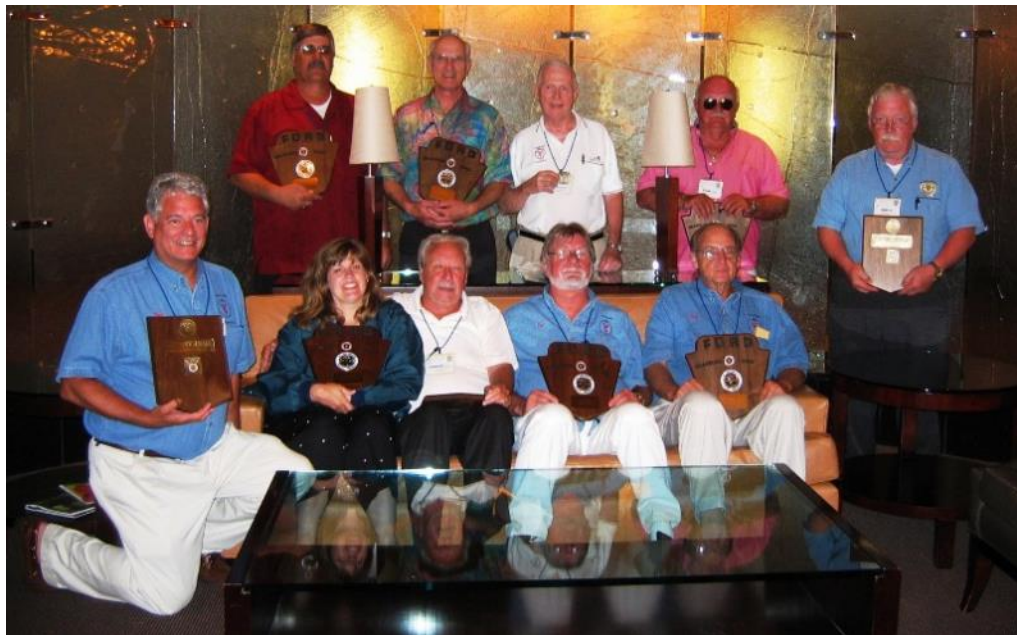
Photo of the Month Grand National Meet Award Winners