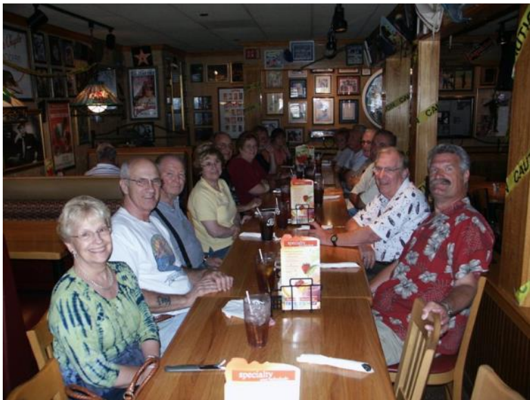
The lunch stop on the way to Dearborn