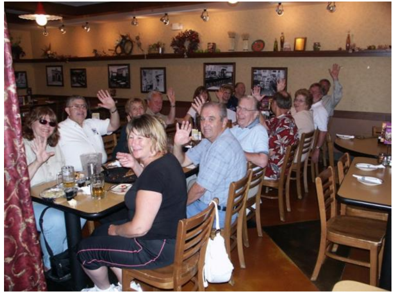
The group at the drivers meeting at Home Run Inn