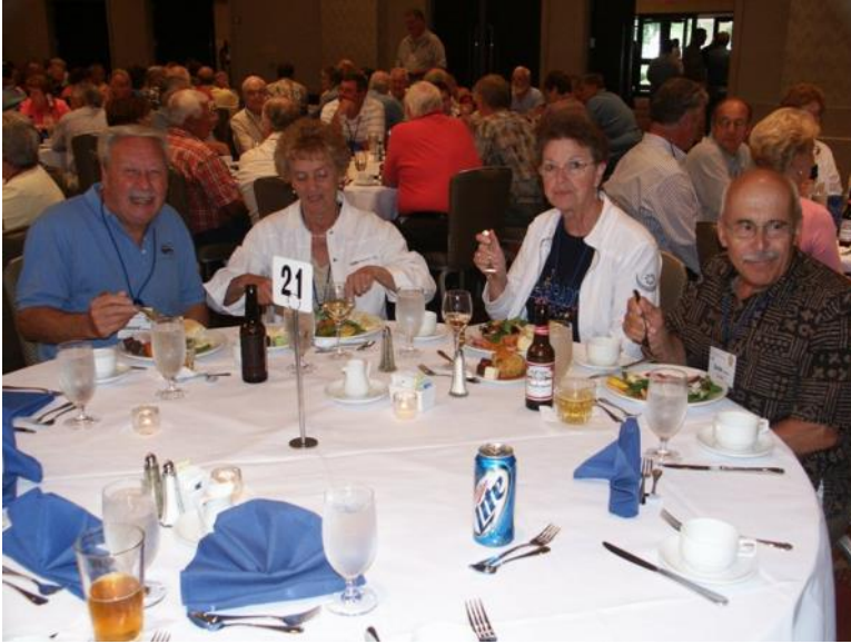
At the Grand National Buffett